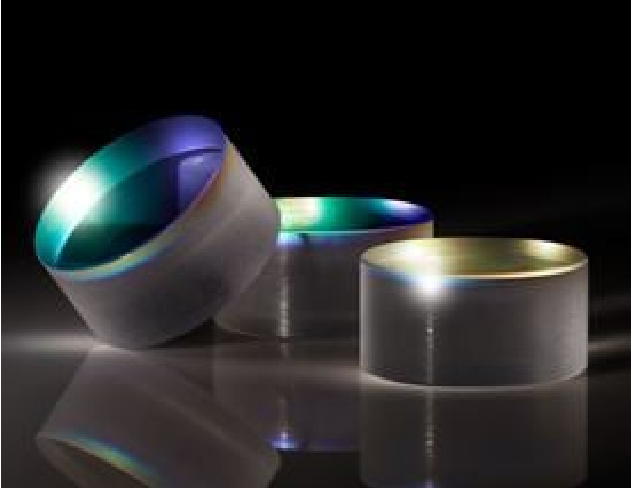
UltraFast Innovations (UFI) High-Power Low-Loss Laser Mirrors