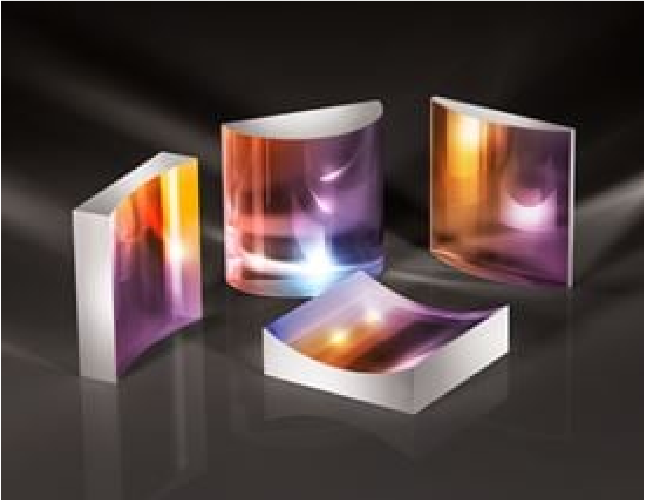
TECHSPEC Beam Shaping Fused Silica Cylinder Lenses