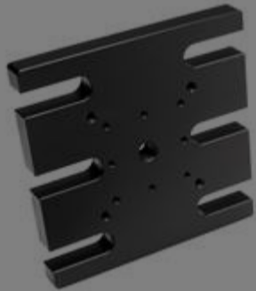
#66-491 - Bottom Adapter Plate for 30mm/40mm Stages, English €77,50