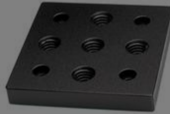
#66-492 - Top Adapter Plate for 30mm/40mm Stages, English €77,50