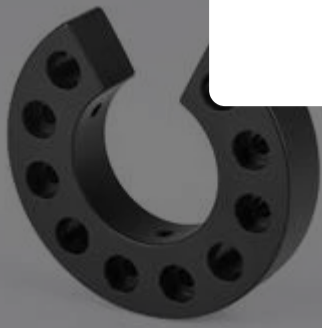
Cage System Filter Holder Plates and Filter Holders