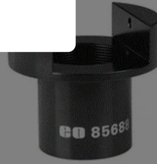
Cage System Fixed Optical Mounts