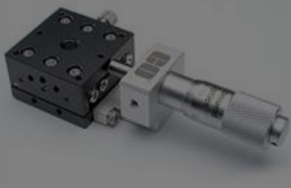
#66-404 - 40mm, Center Drive, Standard Top, English Extended Micrometer €460,00