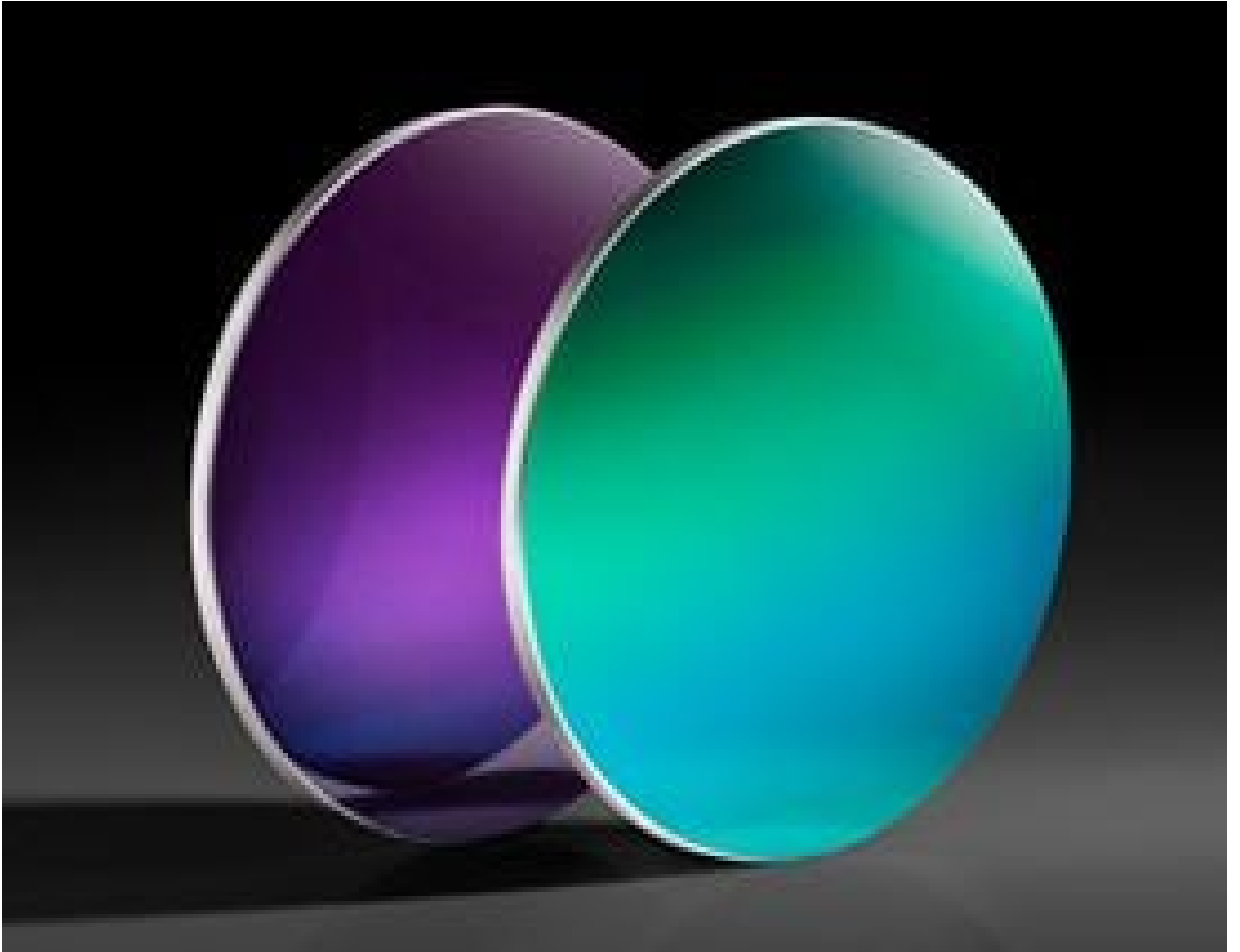
TECHSPEC Silicon (Si) Windows