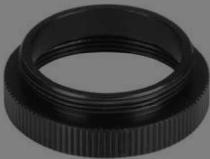
#03-618 - 5mm Spacer to convert CS-Mount Cameras to C-Mount €29,00