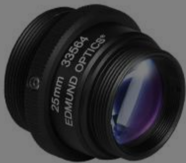
#33-564 - 25mm Cx Series Fixed Focal Length Lens €245,00