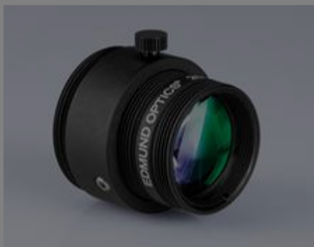
#85-358 - 25mm, f/4 Ci Series Fixed Focal Length Lens €215,00