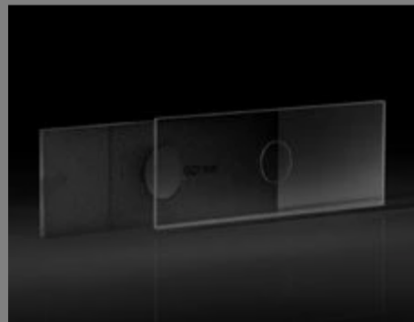
#30-133 - 10mm/ 100 Divisions, Stage Micrometer €289,00