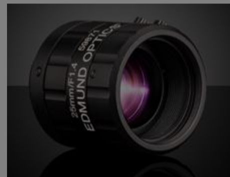
#59-871 - 25mm C Series Fixed Focal Length Lens €260,00