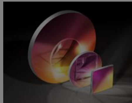
#32-354 - 6.3mm Diameter, 4-6λ Mirror €17,25