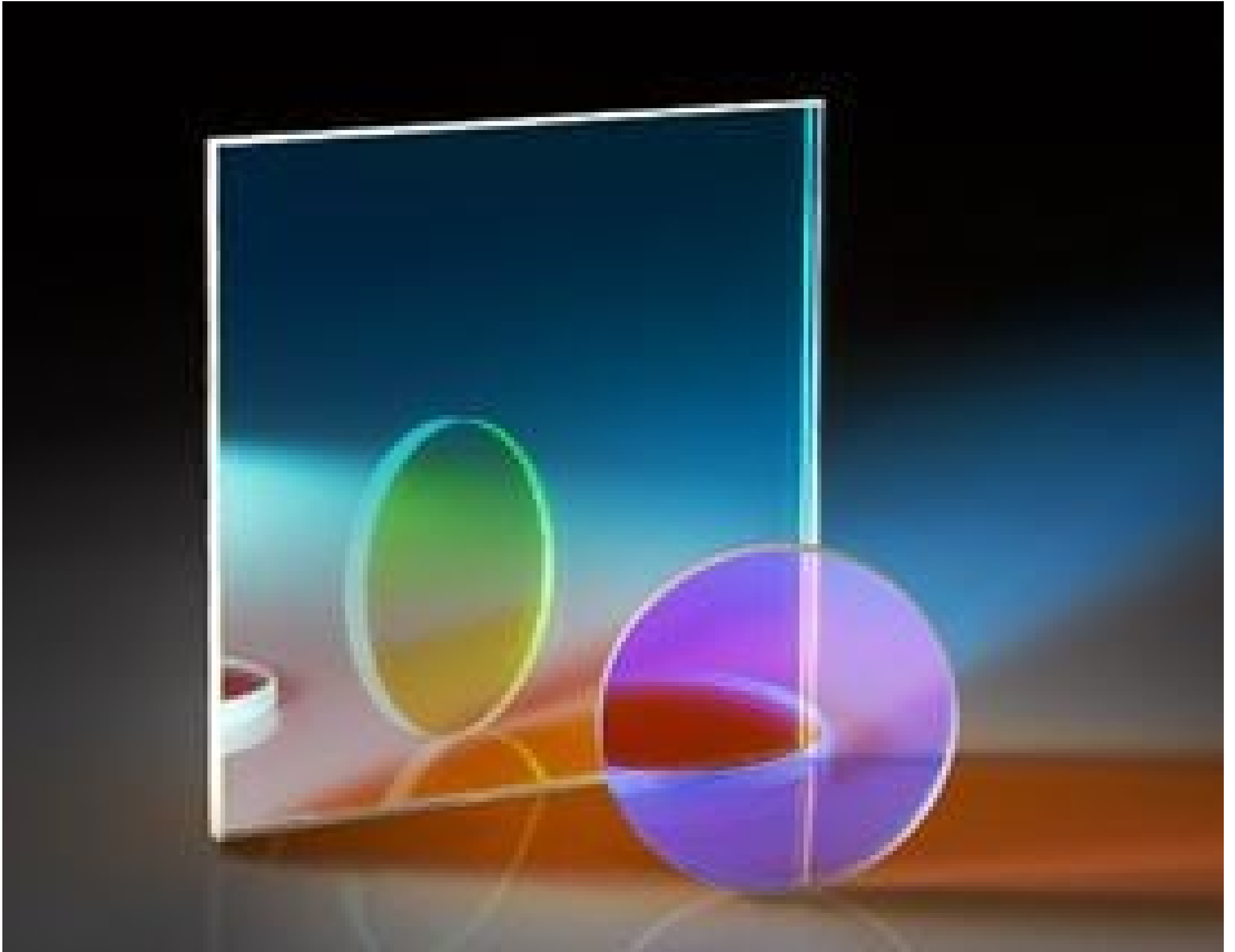
Additive and Subtractive Dichroic Color Filters