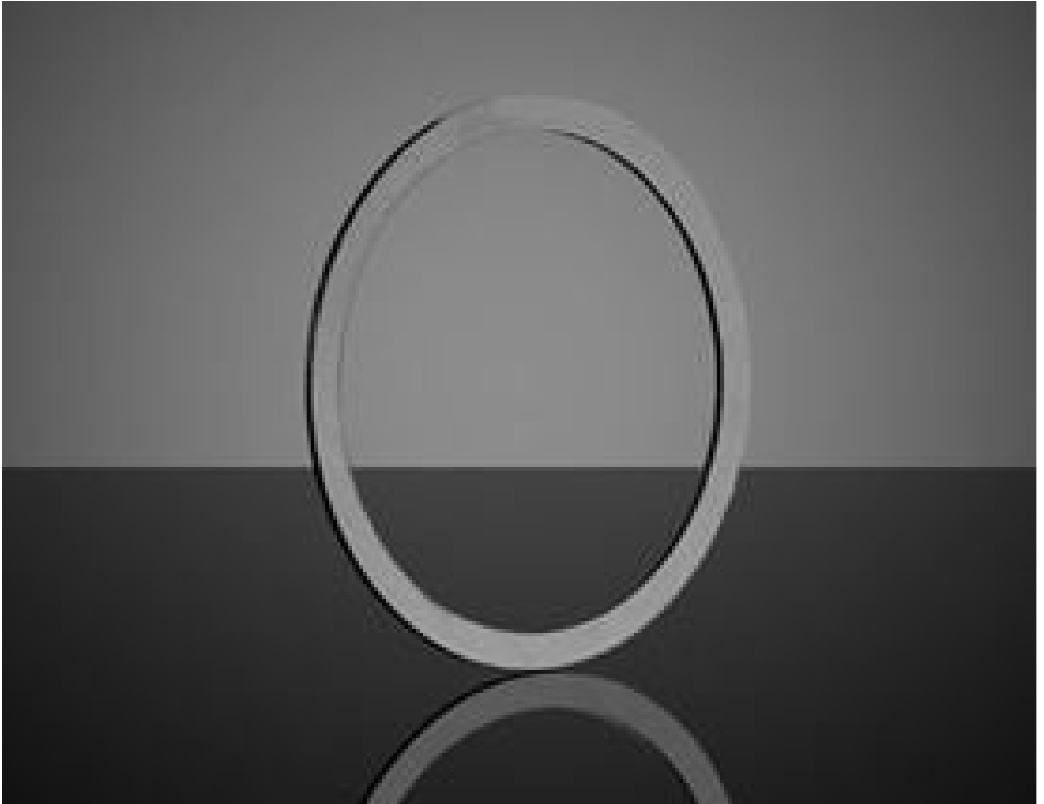
TECHSPEC Multi-Element Spacer Ring