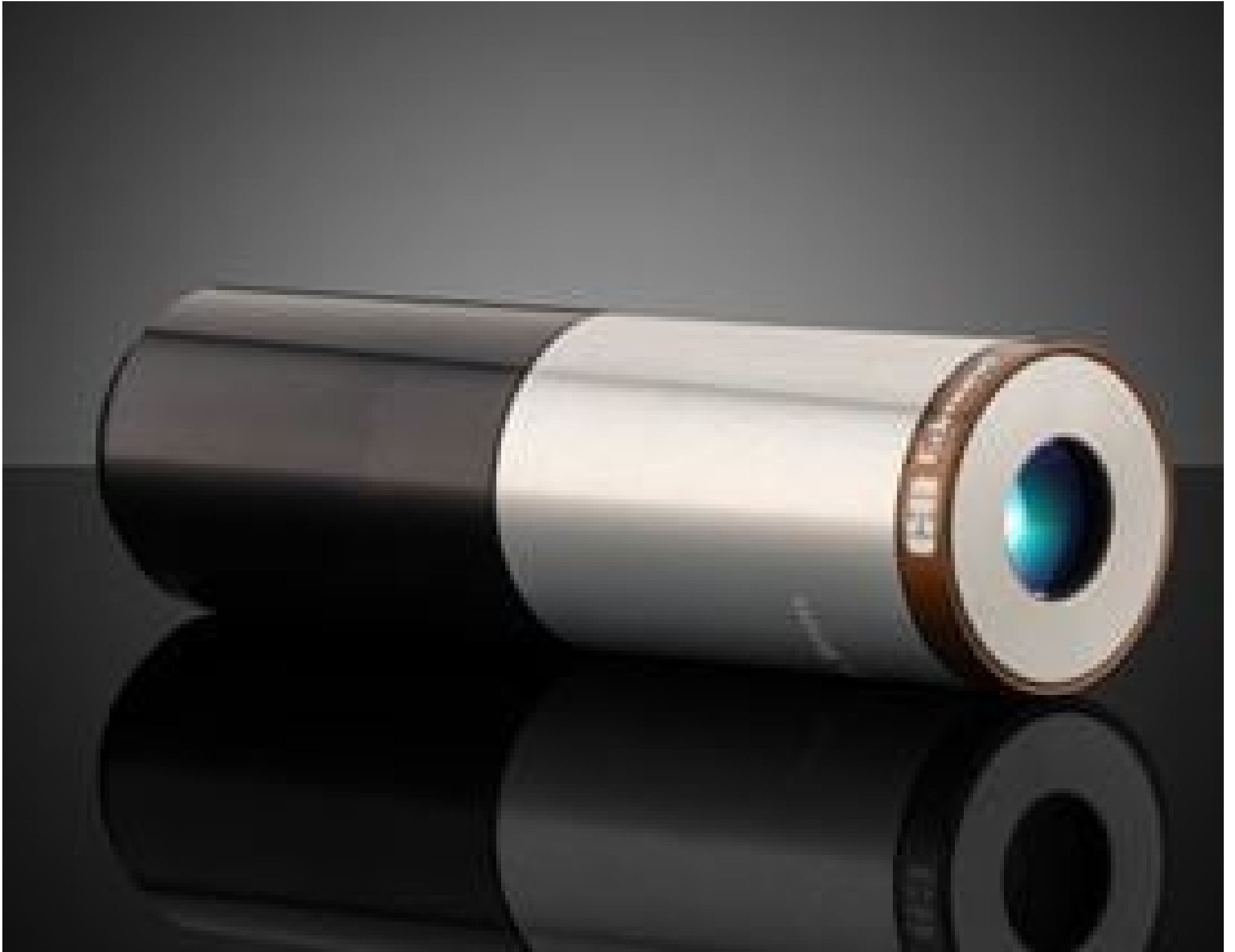
#88-352: 2X Cf Objective