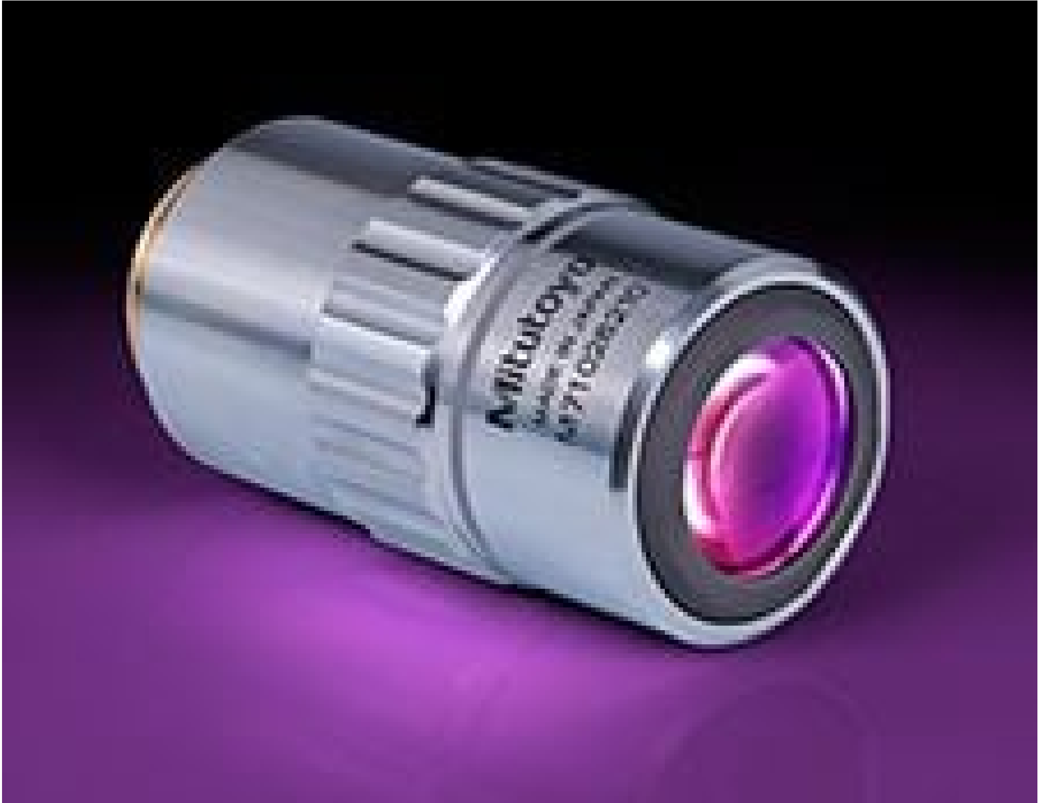
2X Mitutoyo Plan Apo Infinity Corrected Long WD Objective, #46-142