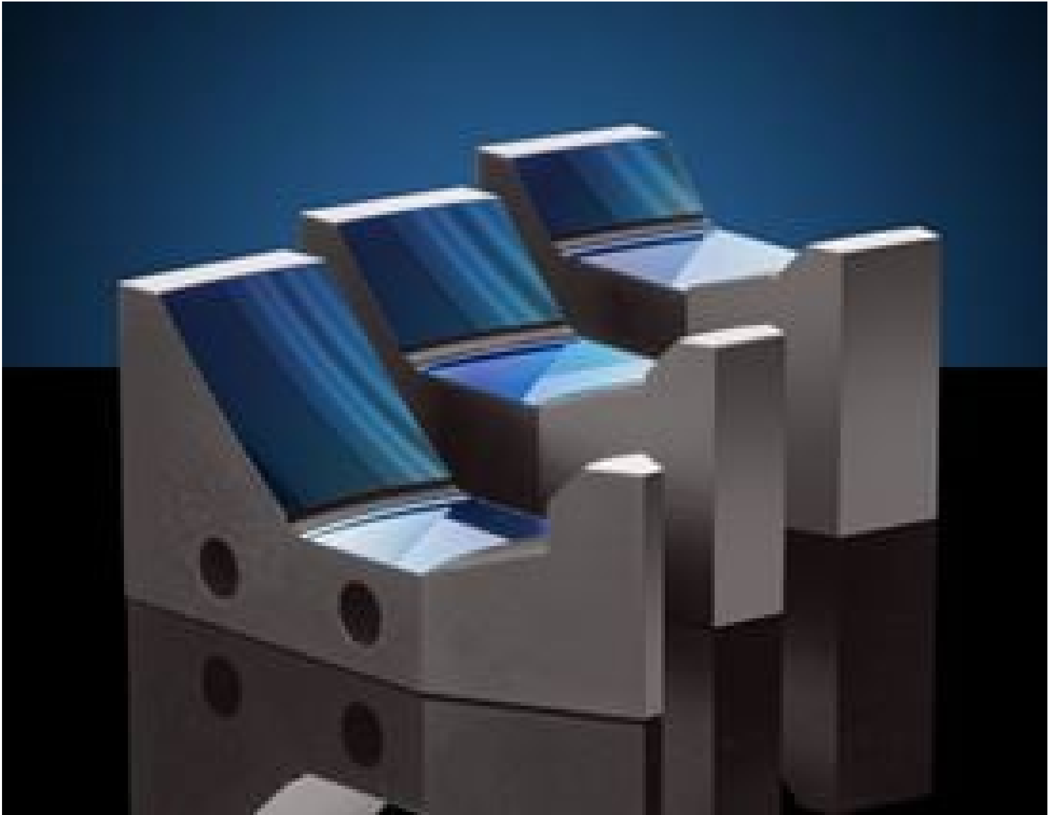
TECHSPEC® Canopus™ Reflective Beam Expanders