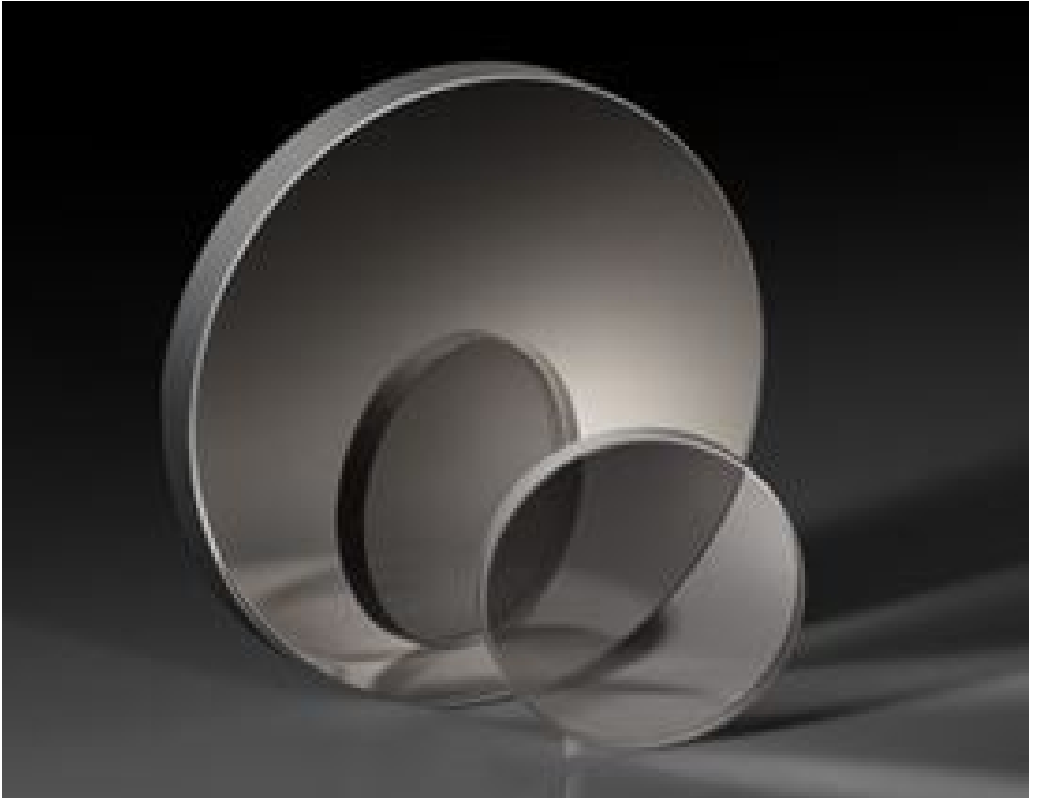
Near-IR (NIR) Neutral Density (ND) Filters