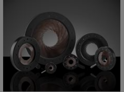
#32-622 - 15mm Max. Aperture, Iris Diaphragm €47,25