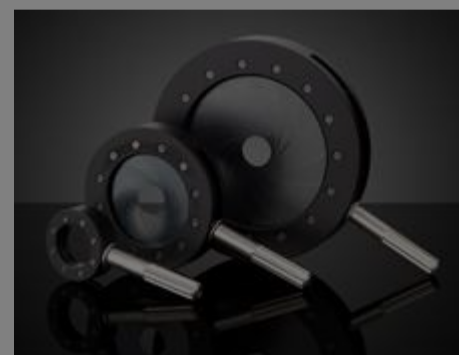
Lockable High Performance Iris Diaphragms