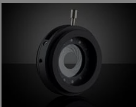
#11-176 - Multi-Element Variable Aperture Joining Ring €182,00