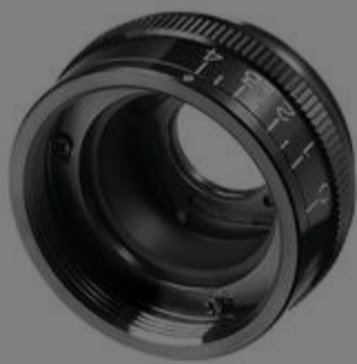
C, S, and T-Mount Iris Diaphragm Mounts