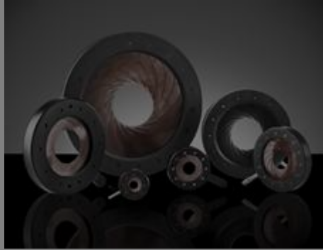
#30-263 - 12mm Max. Aperture, Iris Diaphragm €44,00