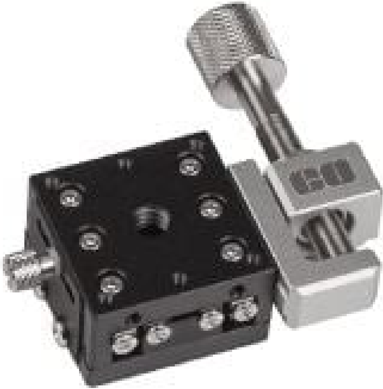
30mm, 0.5" Travel, Lead Screw Drive Stage (Side Drive)