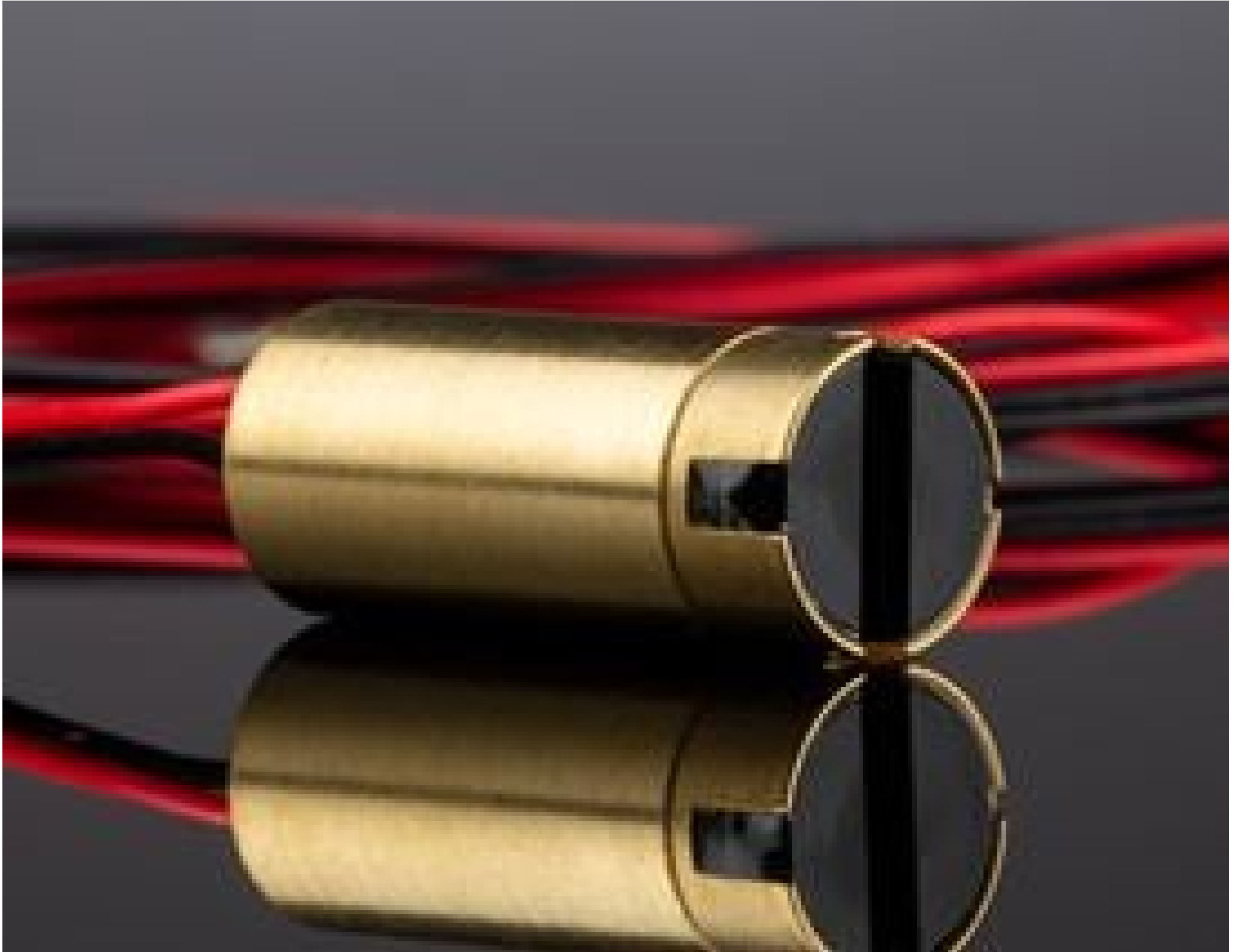
Coherent® Micro VLM™ Laser Diode - Line Option