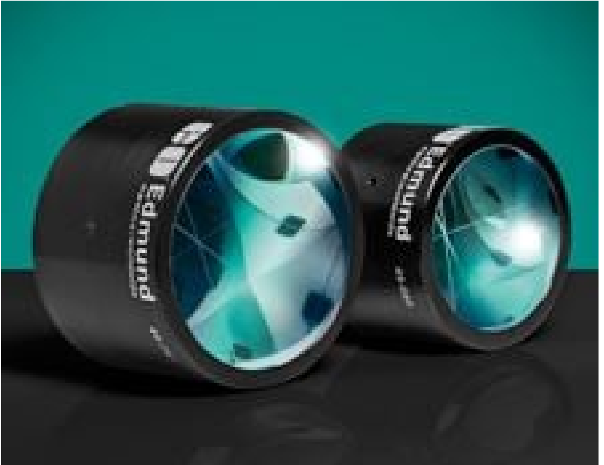
Mounted N-BK7 Corner Cube Retroreflectors