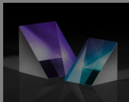
#32-330 - 10mm, Uncoated, N-BK7 Right Angle Prism €57,00