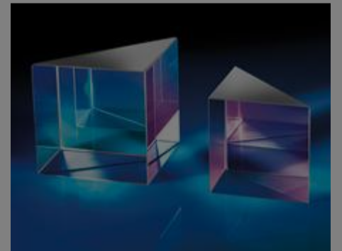
High Tolerance N-BK7 Right Angle Prisms