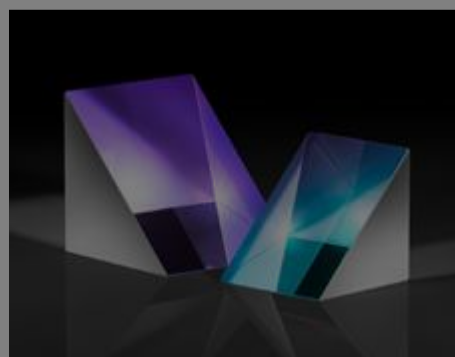
#32-329 - 5mm, Aluminum Coated, N-BK7 Right Angle Prism €65,00