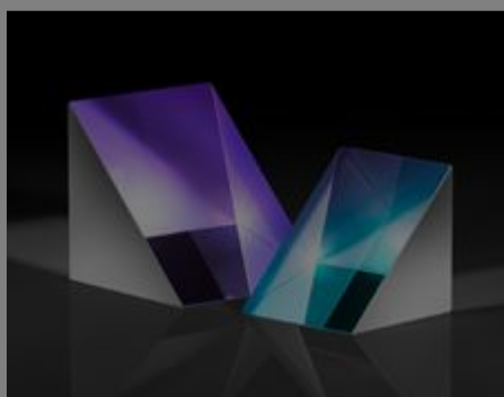
#32-328 - 5mm, Uncoated, N-BK7 Right Angle Prism €52,00