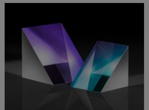
#32-331 - 10mm, Aluminum Coated, N-BK7 Right Angle Prism €69,50