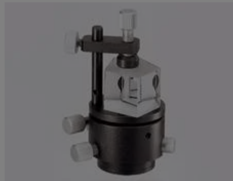
Metric Prism Mounts