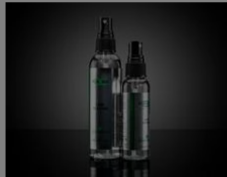
PUROSOL™ Optical Cleaner