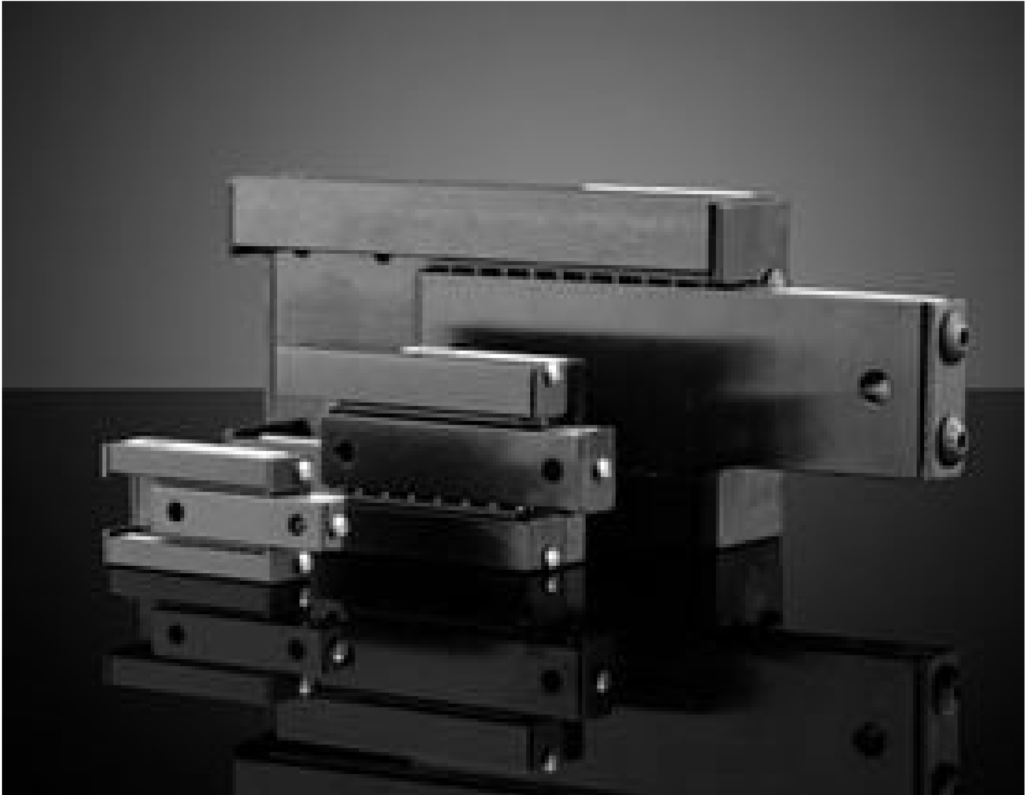
Linear Motion Ball Bearing Slides