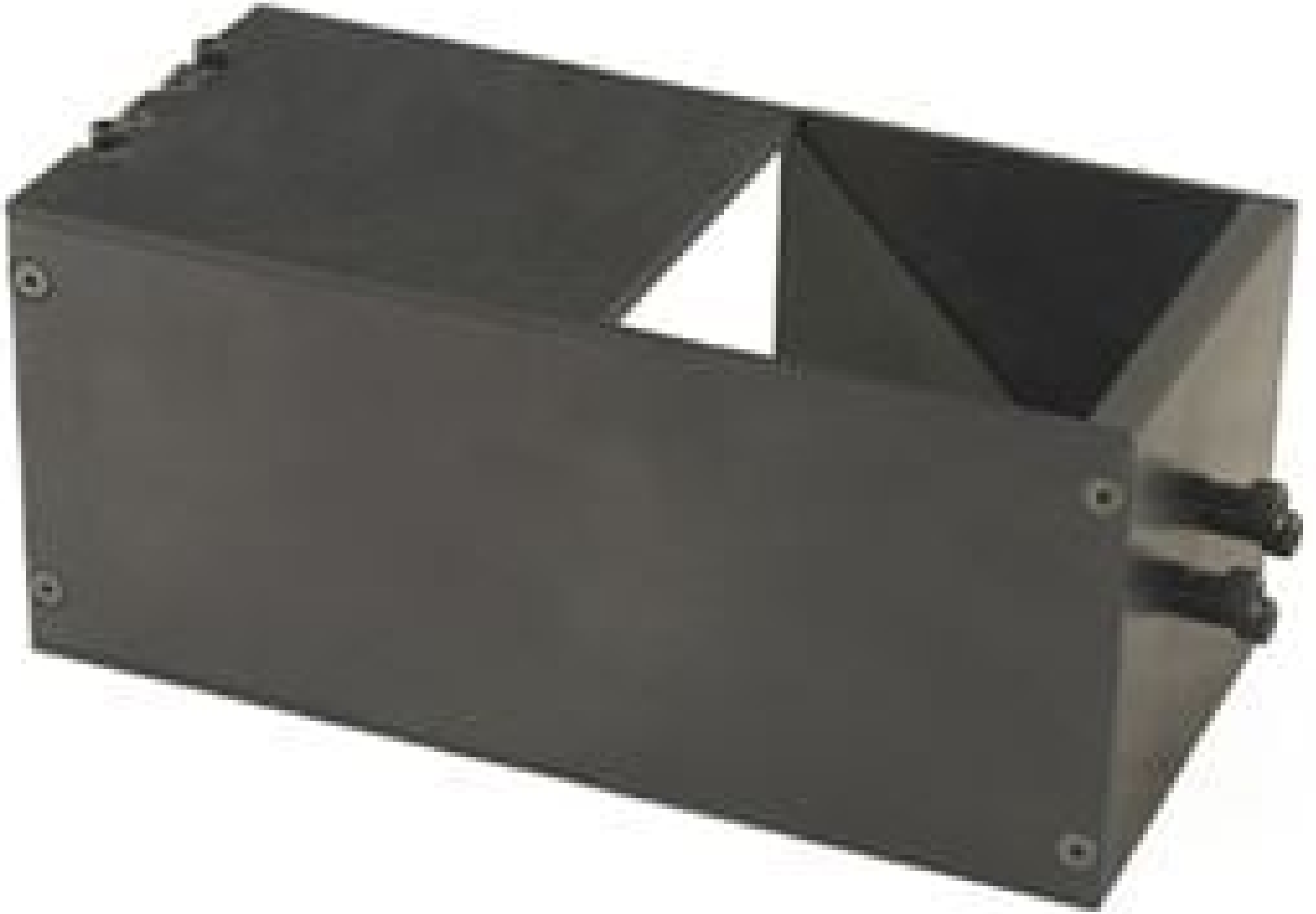
4" Fiber Optic Diffuse Axial Illuminators (#53-381)