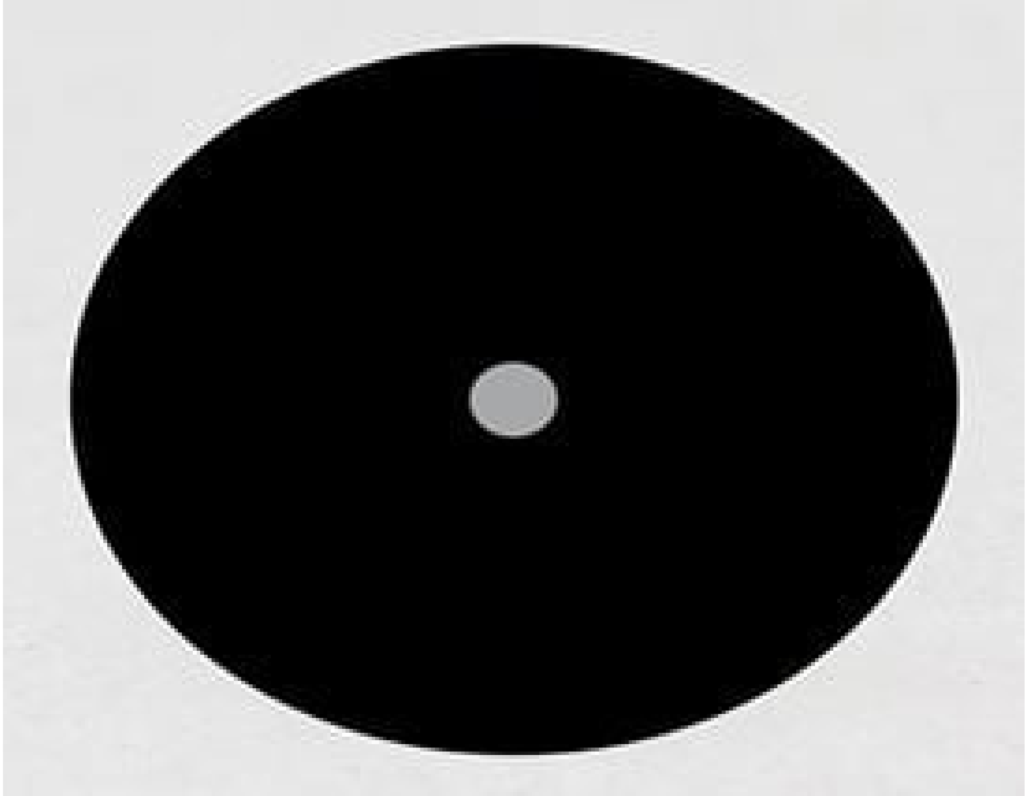
Acktar Blackened Pinholes (unmounted)