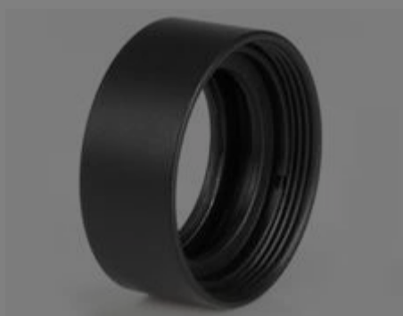
Cage System Optical Lens Mounts