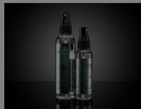
PUROSOL™ Optical Cleaner