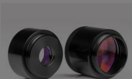
C, S, and T-Mount Circular Optic Mounts