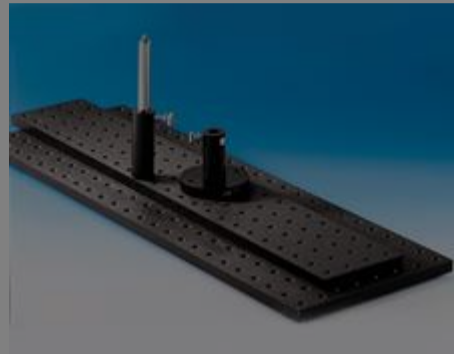
#03-643 - 36" x 12", Breadboard €491,00