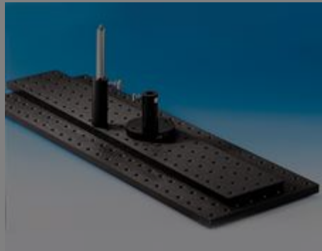
#03-642 - 36" x 8", Breadboard €404,00