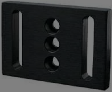
#03-655 - Sliding 2" x 3" Base Plate €25,25