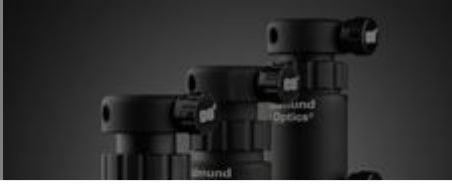
Steel Optical Mounting Posts

Please select your shipping country to view the most accurate inventory information, and to determine the correct Edmund Optics sales office for your order.