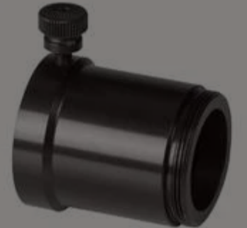
#03-628 - 23mm Diameter, C-Mount Eyepiece Mount €46,50