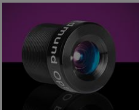
HEO Series M12 Lenses