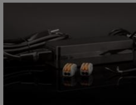
#66-855 - 24V Power Supply with Tinned Leads €95,00