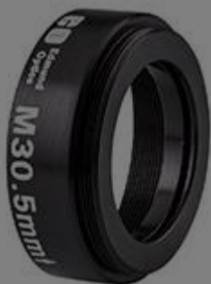
#65-801 - M30.5 x 0.5 Mount for 25mm Diameter Filters €59,00