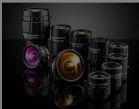
C Series Fixed Focal Length Lenses