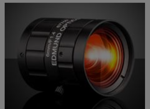
#67-709 - 6mm C Series Fixed Focal Length Lens €350,00