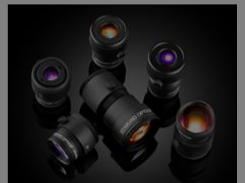
Ci Series Fixed Focal Length Lenses