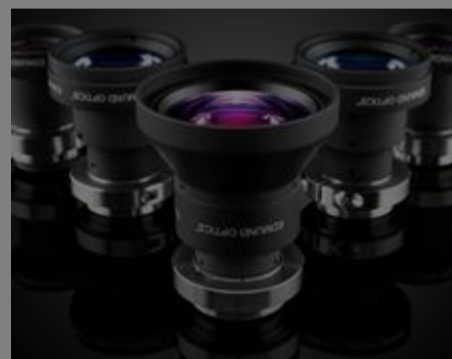
HRr Series Fixed Focal Length Lenses