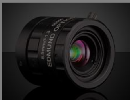
#58-000 - 8.5mm C Series Fixed Focal Length Lens €275,00