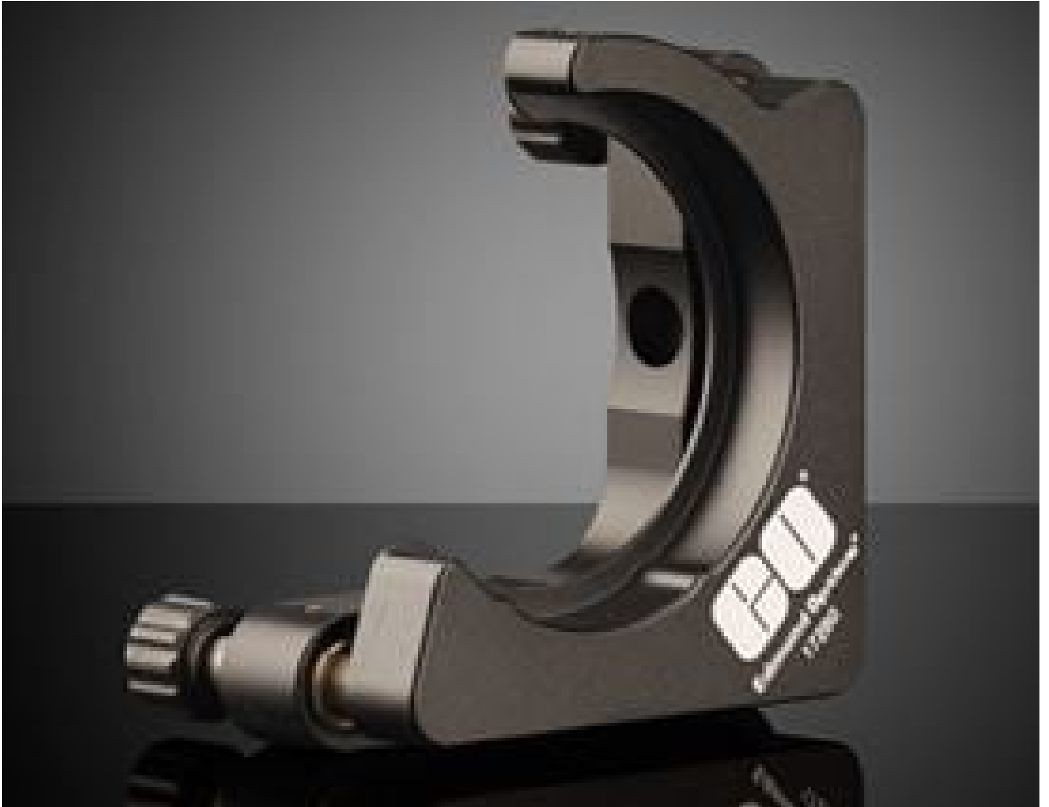
#17-280, 50.0/50.8mm Optic Dia., E-Series Clear Edge Kinematic Mount