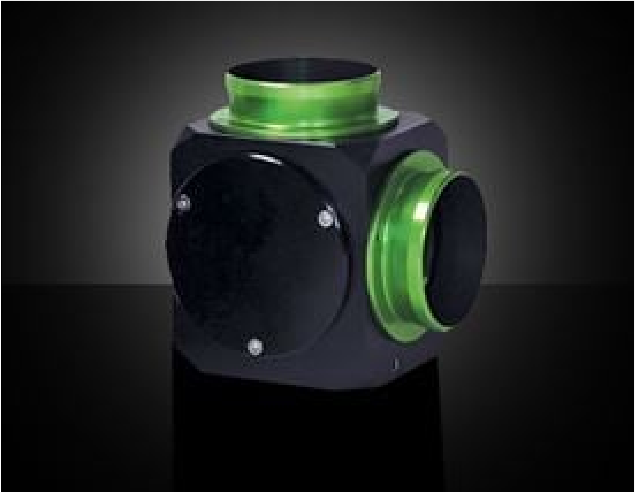
50/50 Beamsplitter Cube