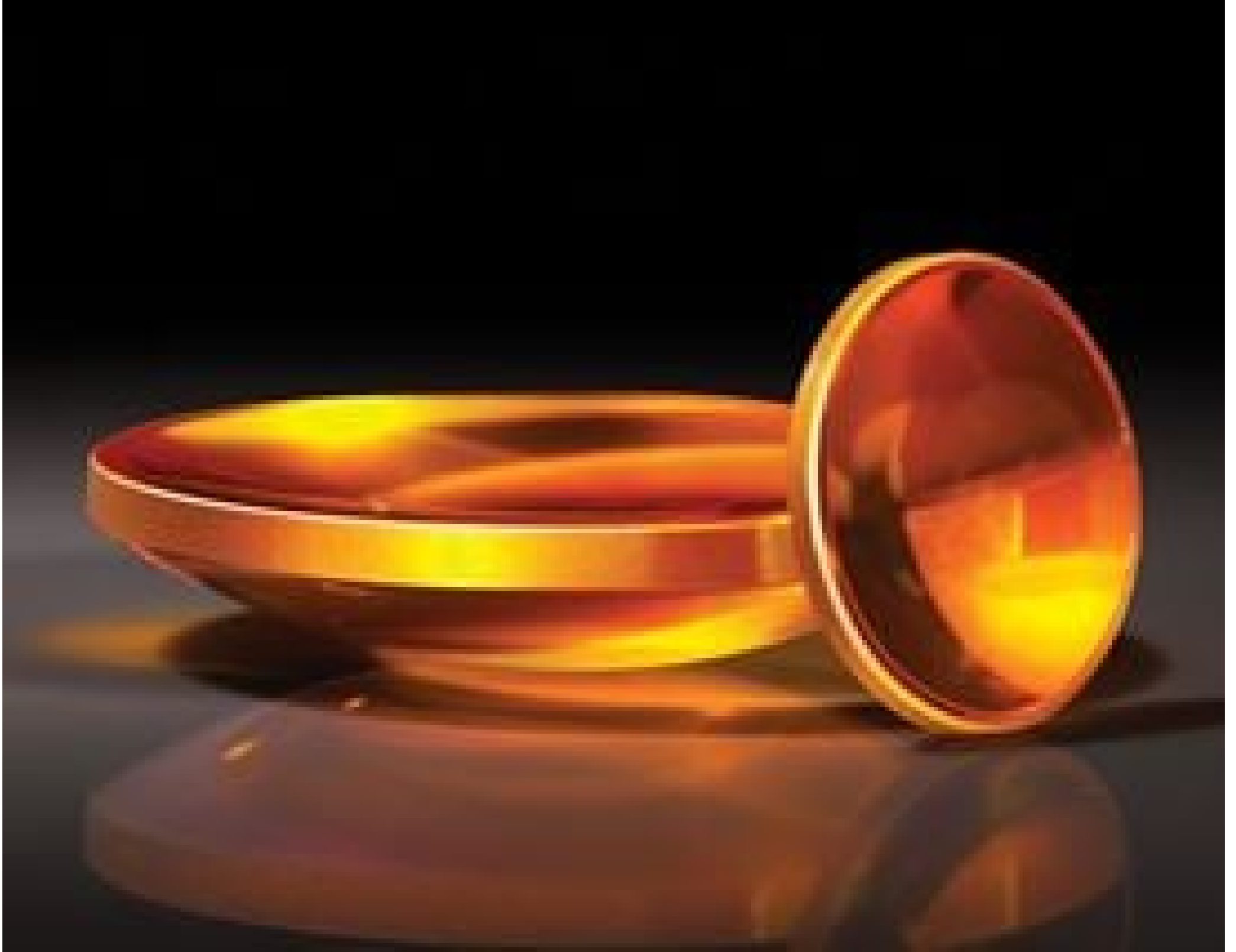
TECHSPEC Zinc Selenide (ZnSe) Aspheric Lenses