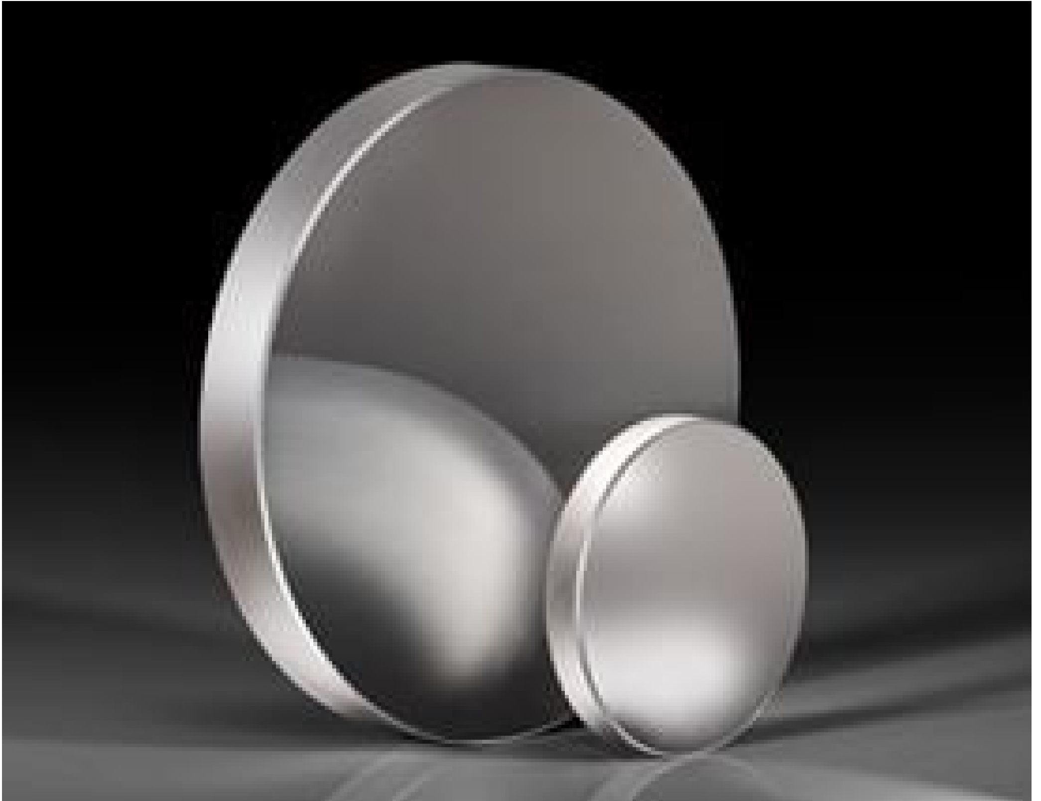
TECHSPEC® Ultrafast-Enhanced Silver Concave Laser Mirrors