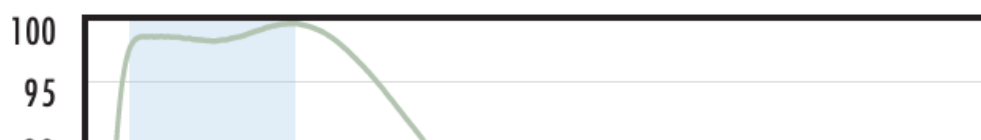
Fused Silica with UV-AR Coating Typical Transmission

Typical transmission of a 3mm thick fused silica window with UV-AR (250-425nm) coating at 0° AOI.