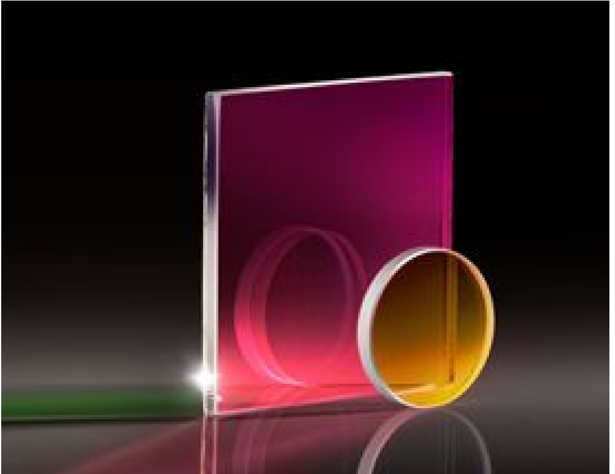
Extended Hot Mirrors