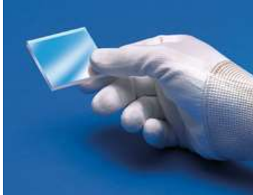
Component Handling Tools

These optics require special handling to avoid damage and ensure long-term performance. Proper handling, cleaning, and storage are essential to maintain optical quality. Explore our Optics Cleaning Resources for step-by-step guides and best practices. For personalized assistance, Email us or Chat with our technical support team.