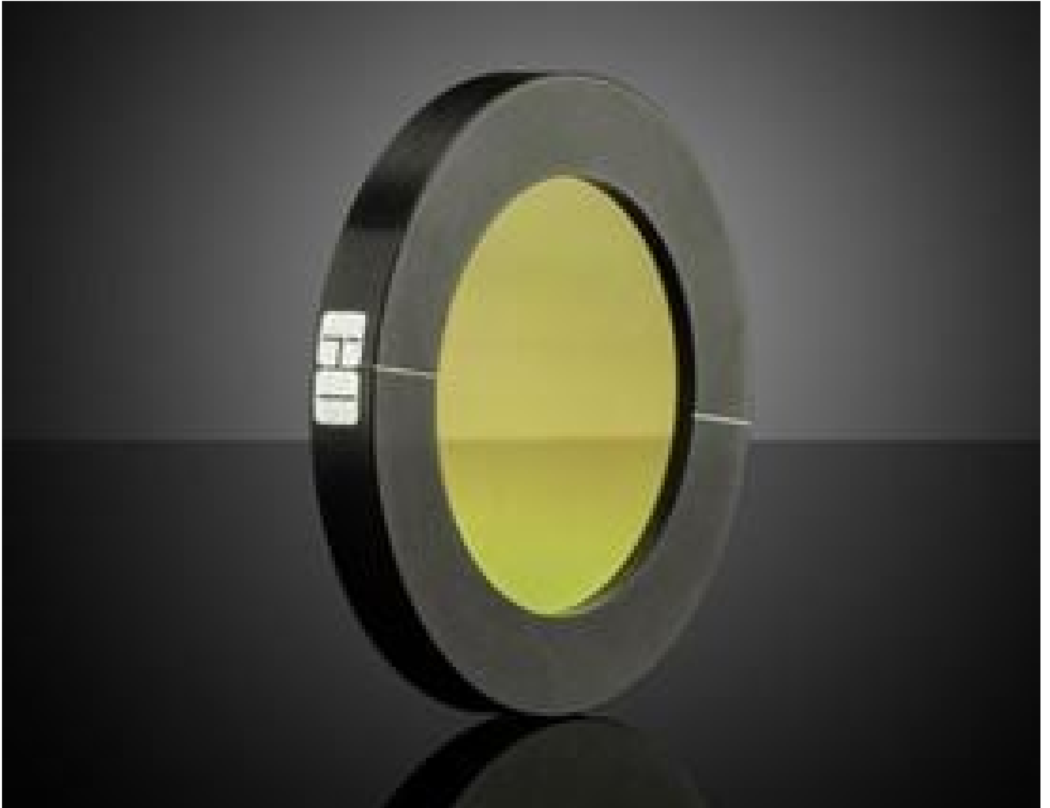
50mm Dia. KRS-5, IR Holographic Wire Grid Polarizer, #62-775