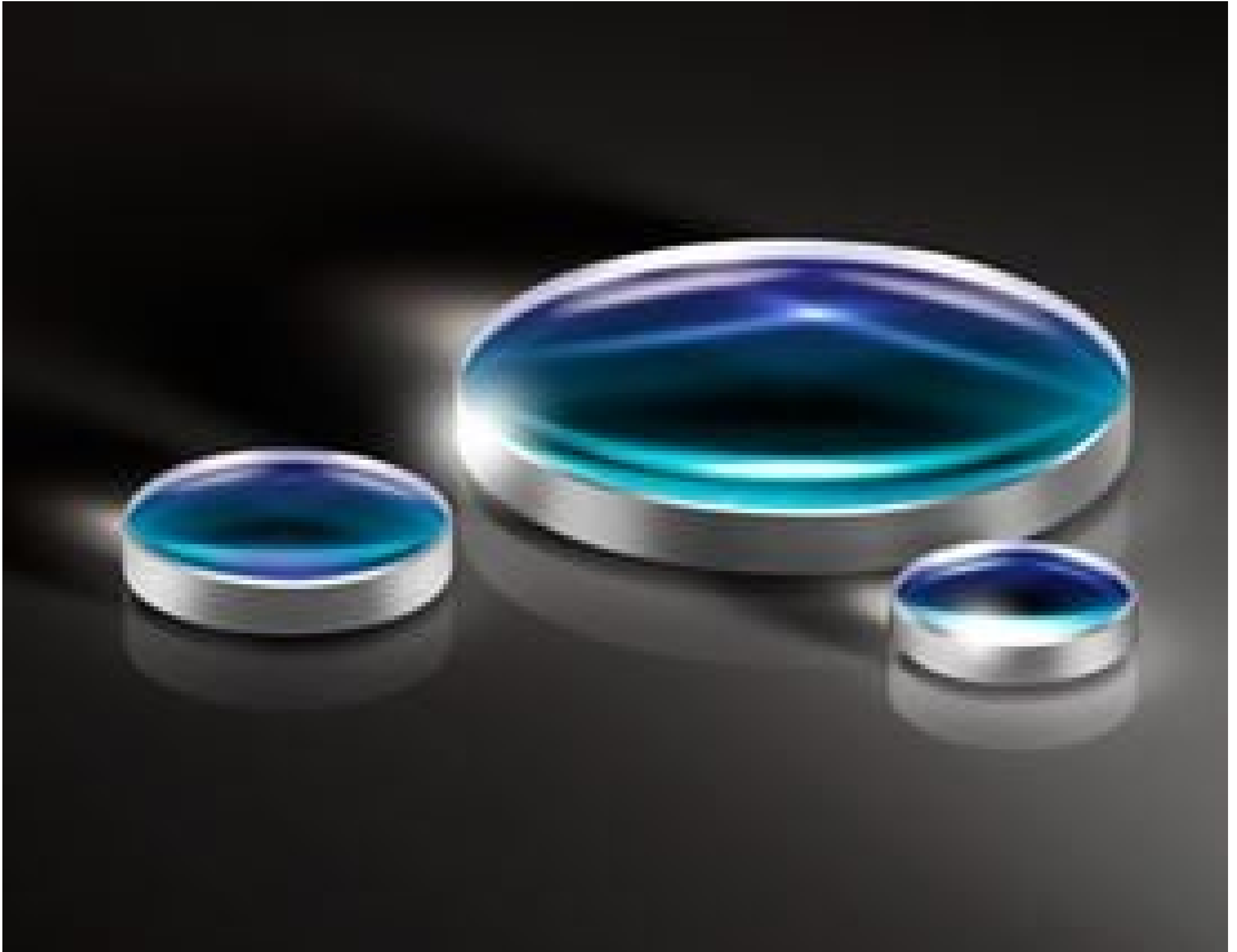
UV Fused Silica Double-Convex (DCX) Lenses