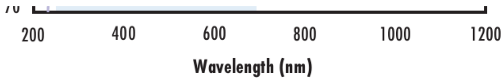
Fused Silica with VIS-EXT Coating Typical Transmission