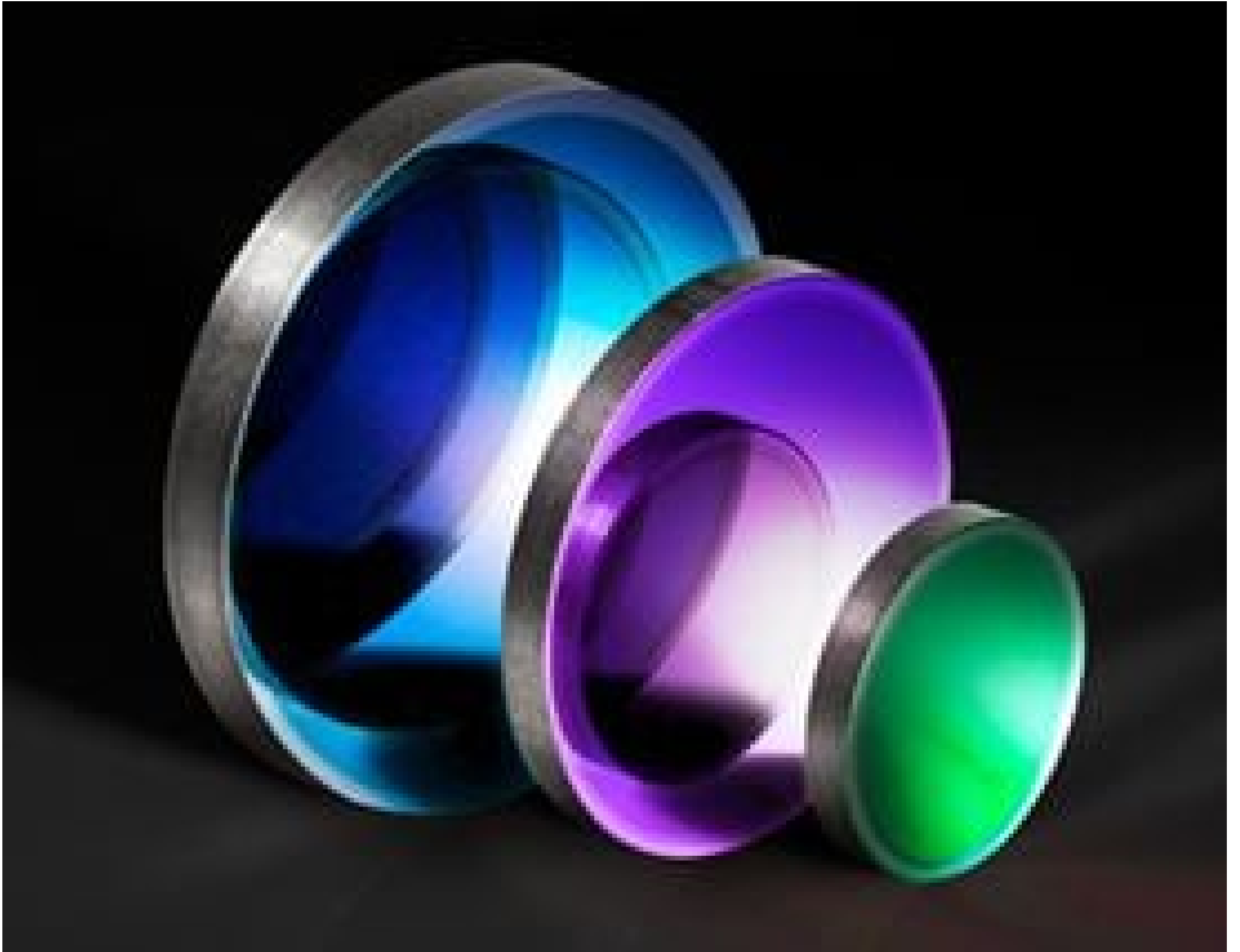
Germanium (Ge) Windows