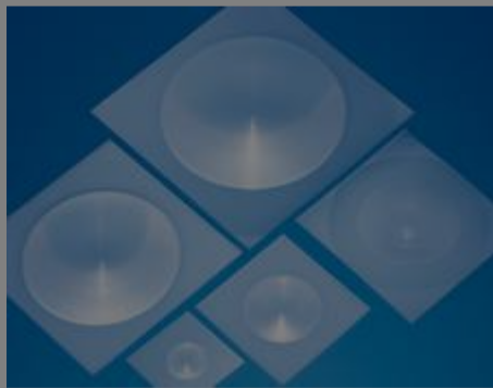
#32-796 - 2.0" x 2.0", FL 0.79", IR Fresnel Lens €39,50