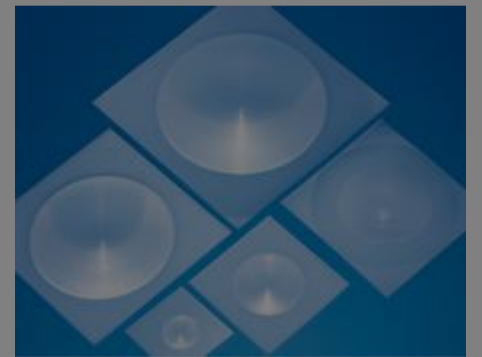
#32-797 - 1.5" x 1.5", FL 0.92", IR Fresnel Lens €39,50