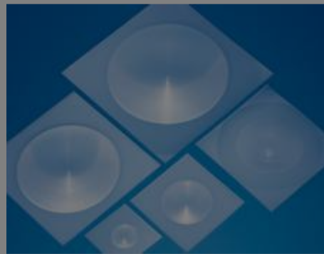
#32-798 - 2.3" x 2.3", FL 1.2", IR Fresnel Lens €39,50