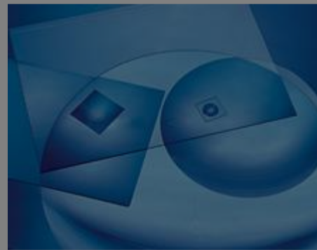
#32-590 - 3.0" x 3.0", 2.6" Focal Length, Fresnel Lens €50,50