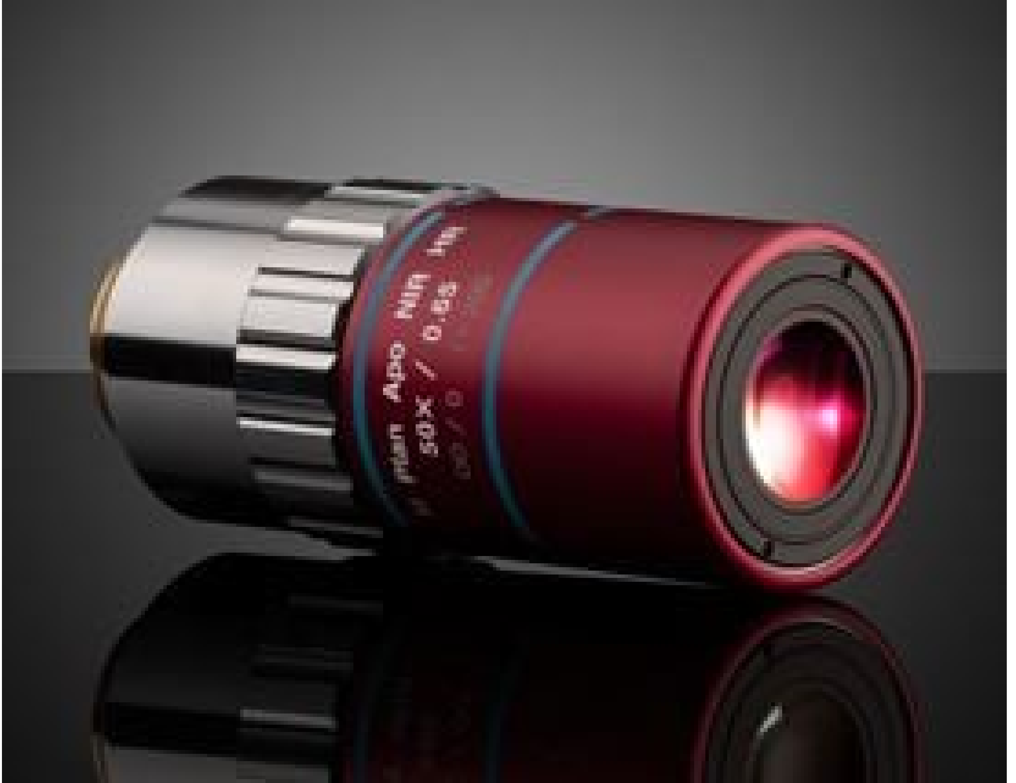
50X Mitutoyo Plan Apo NIR HR Infinity Corrected Objective, #56-982