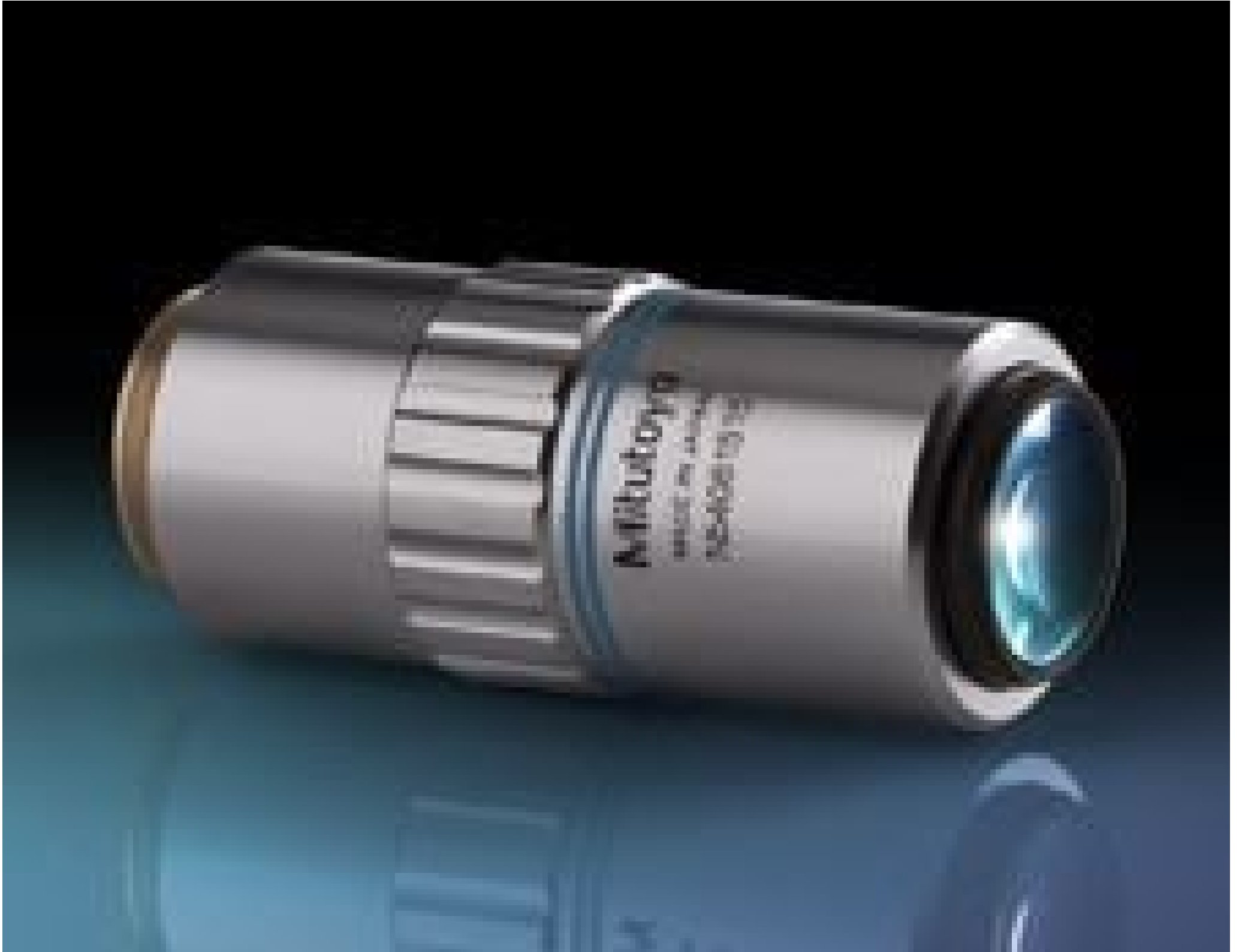
50X Mitutoyo Plan Apo SL Infinity Corrected Objective, #46-399