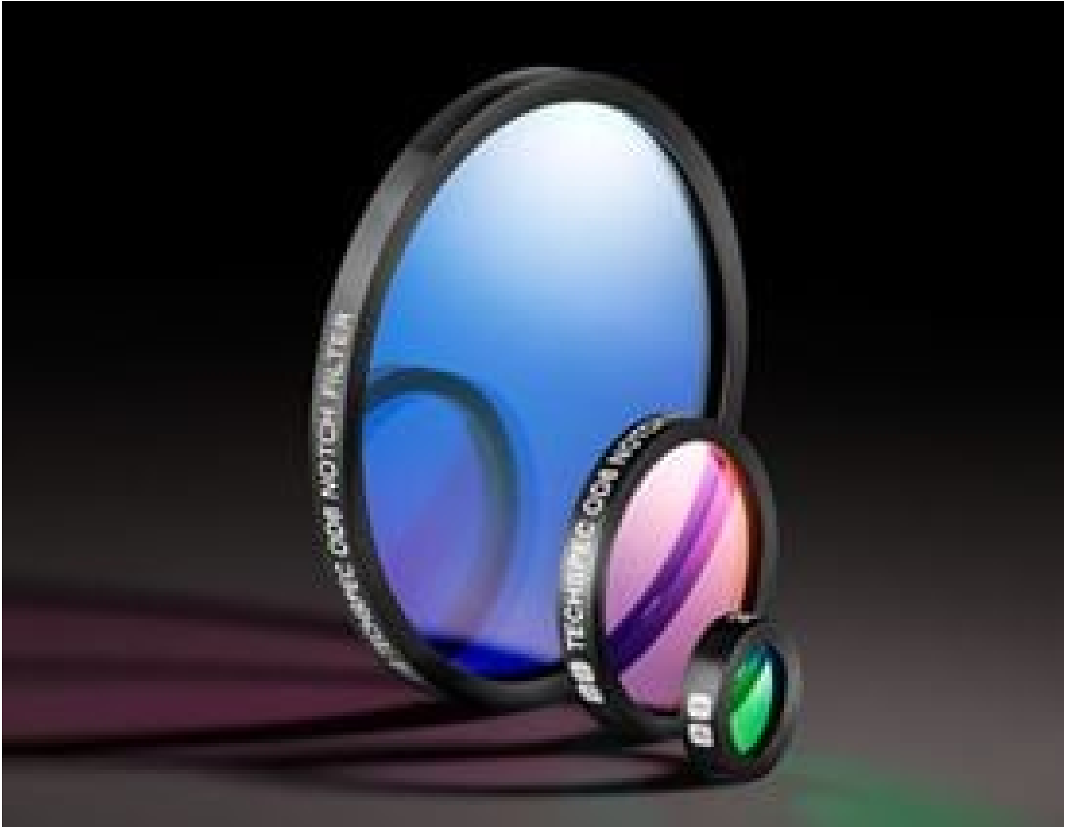
TECHSPEC OD 6.0 Multi-Notch Filters for Nd:YAG Lasers