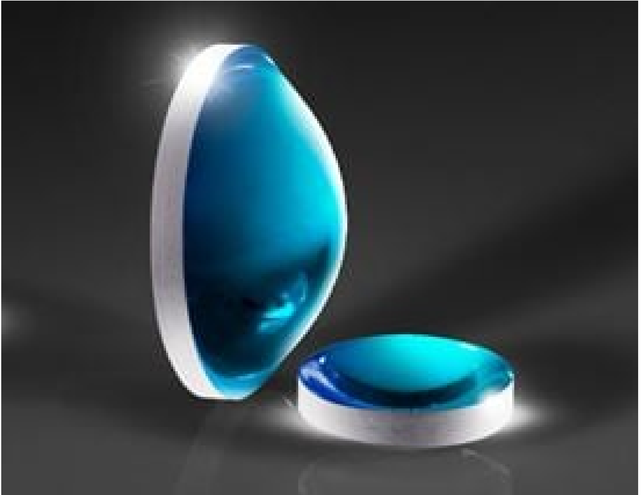
Molded Aspheric Condenser Lenses