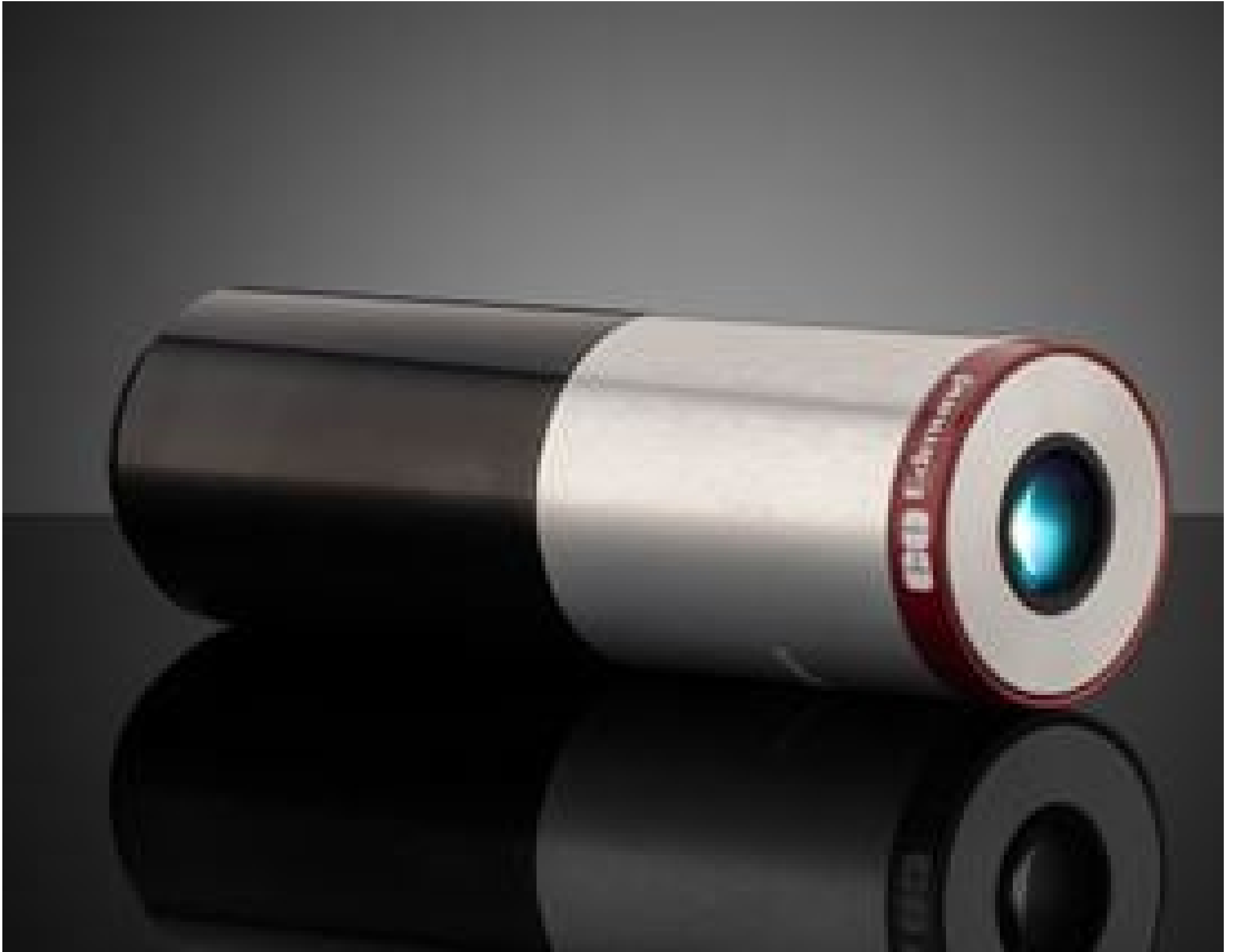
#88-353: 5X Cf Objective