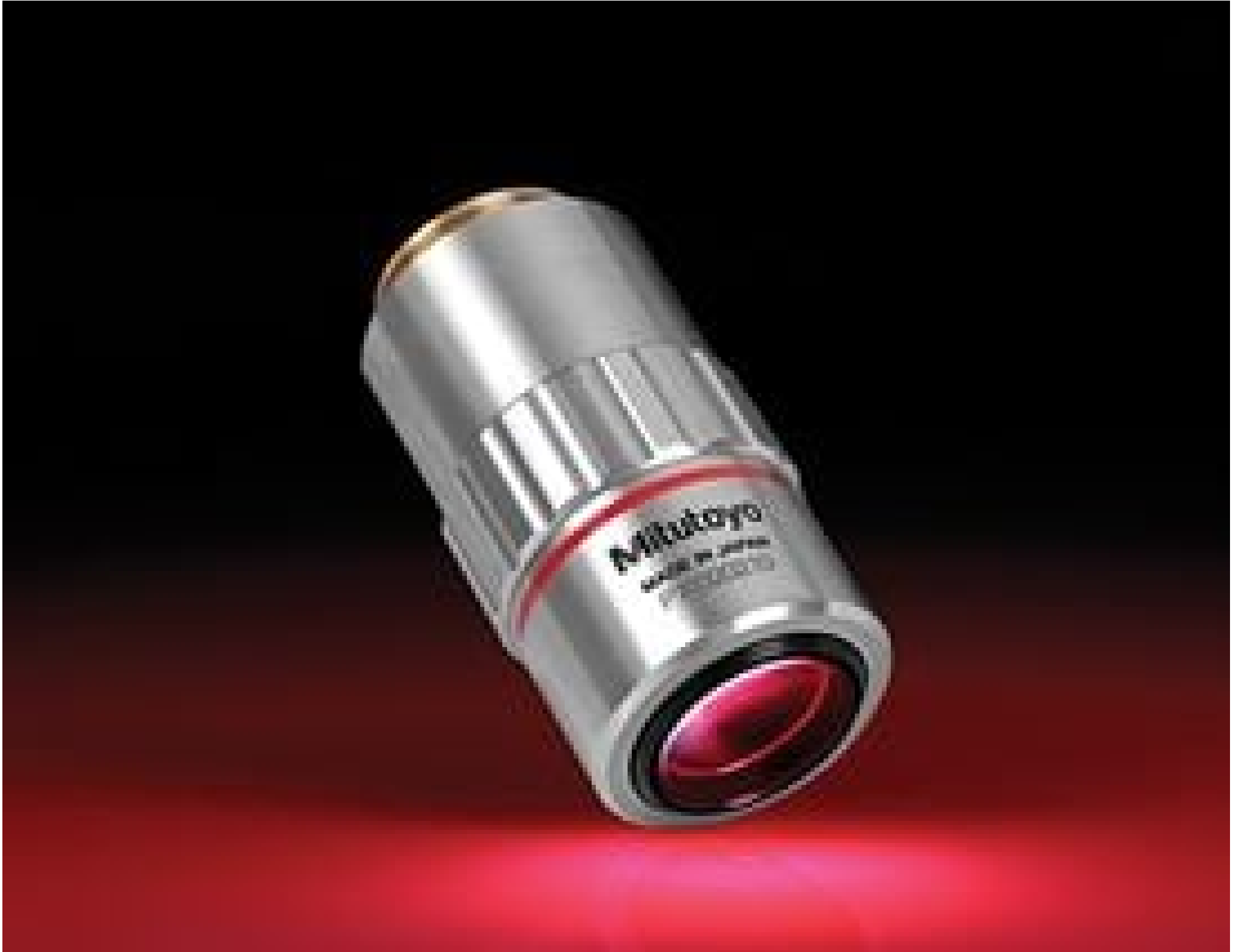
5X Mitutoyo Plan Apo Infinity Corrected Long WD Objective, #46-143