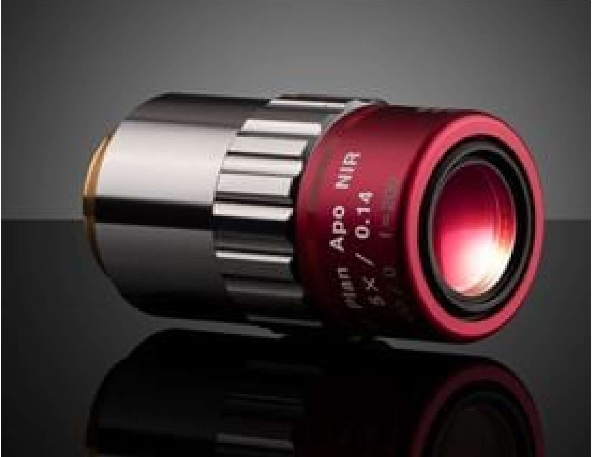
5X Mitutoyo Plan Apo NIR Infinity Corrected Objective, #46-402