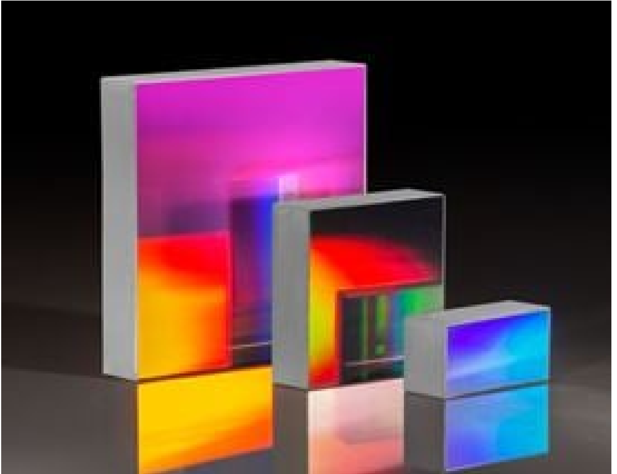
Reflective Ruled Diffraction Gratings