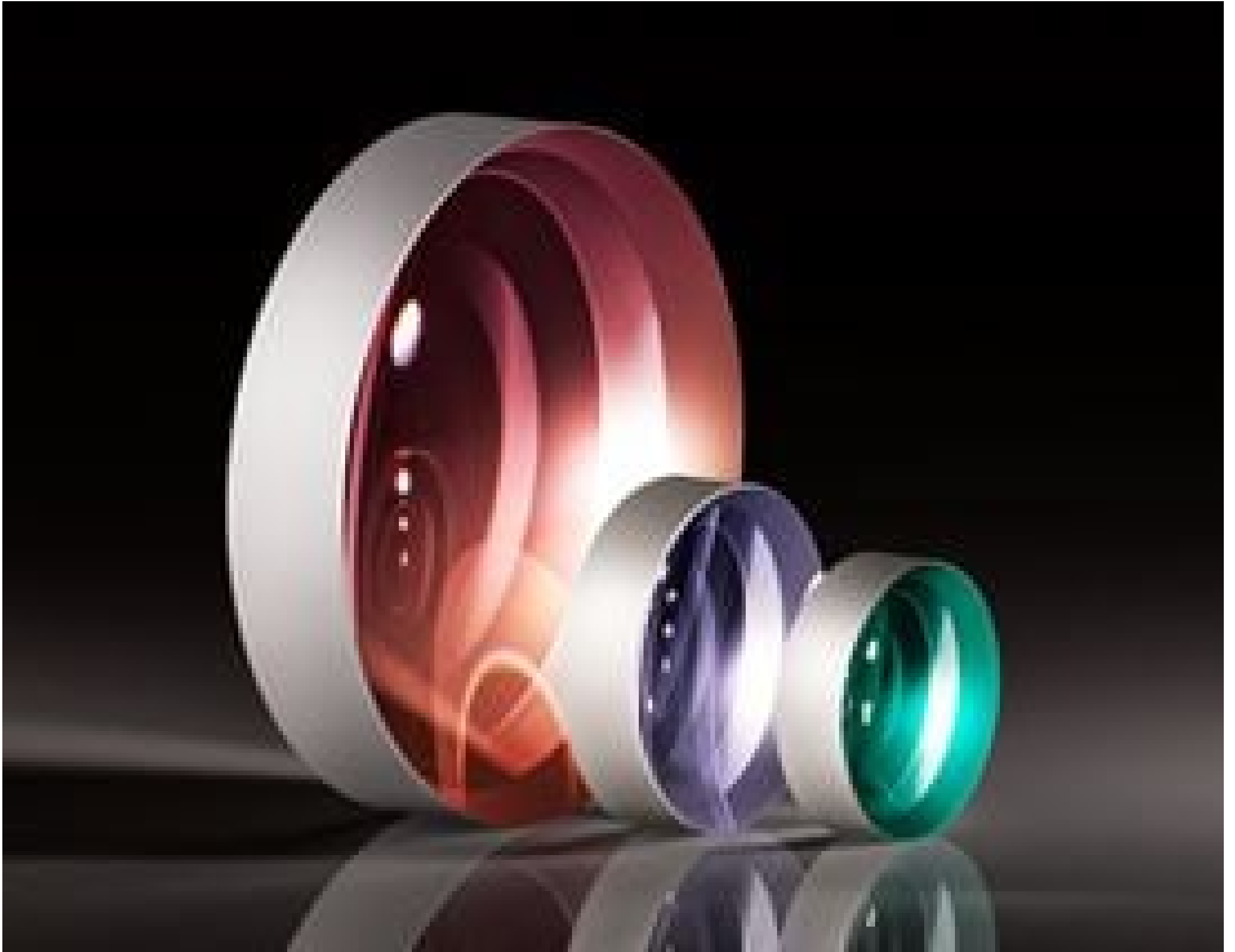
TECHSPEC Uncoated Plano-Concave (PCV) Lenses