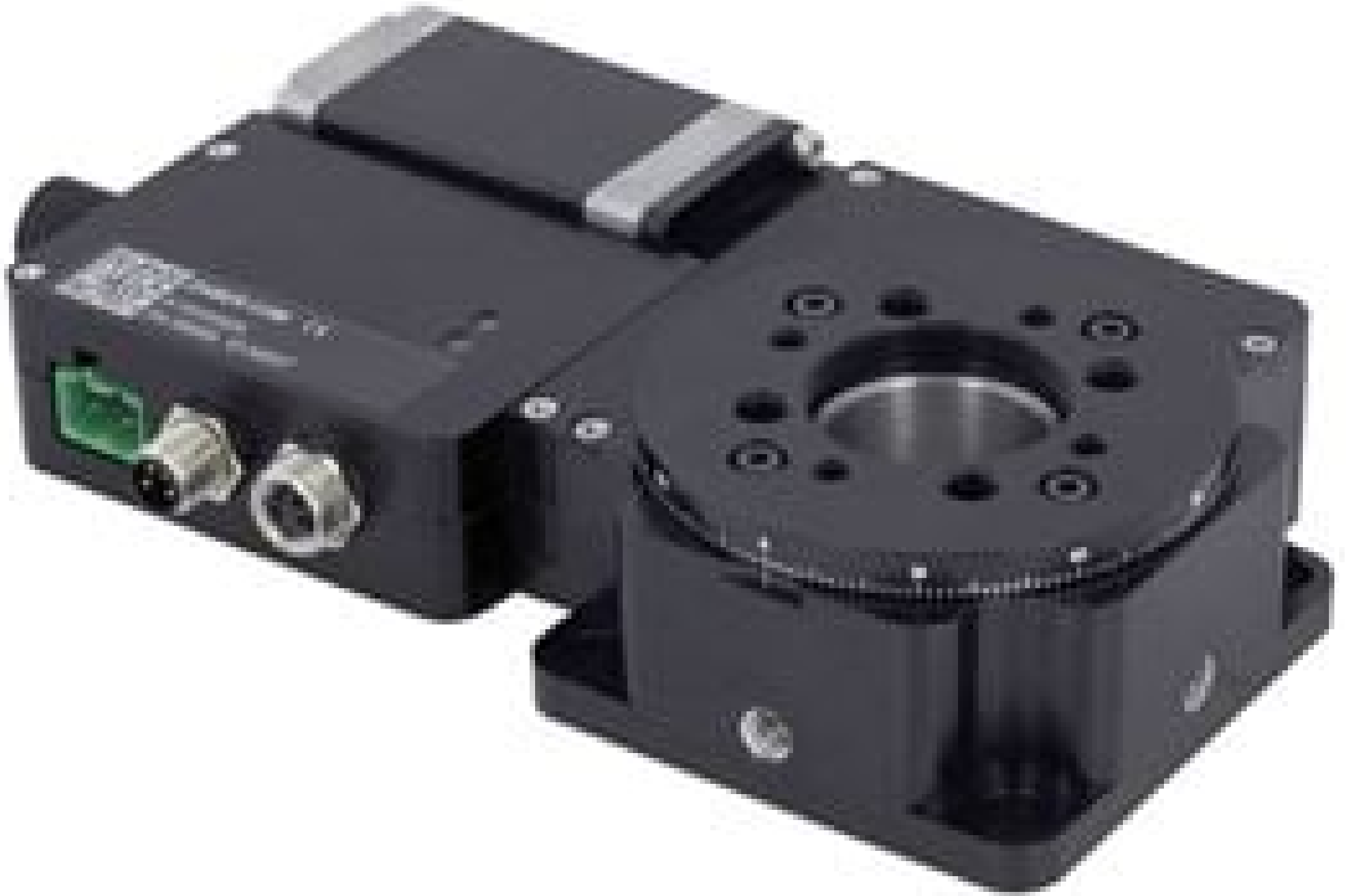
60mm Motorized Rotary Stage, #15-291