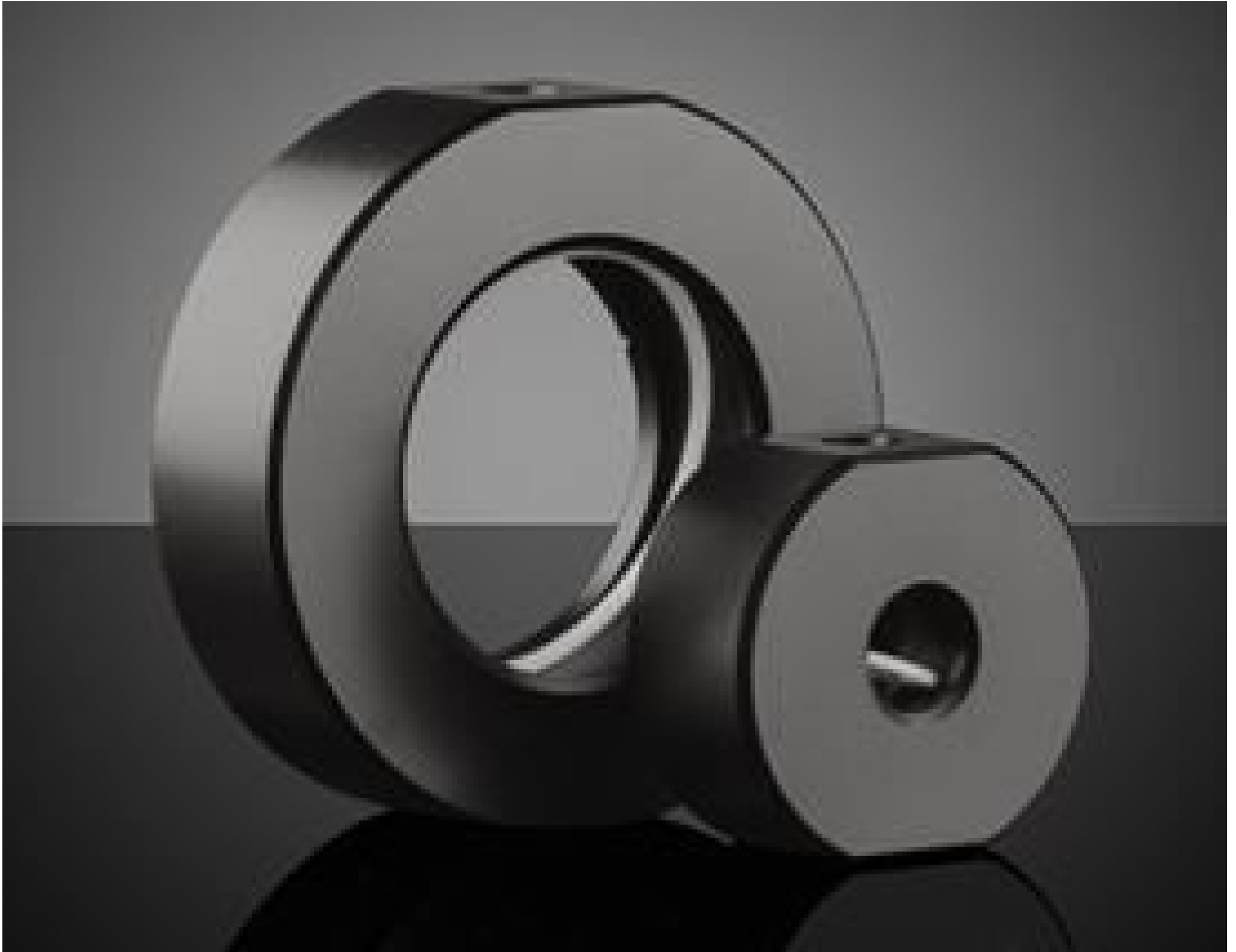
Optic Component Mounts