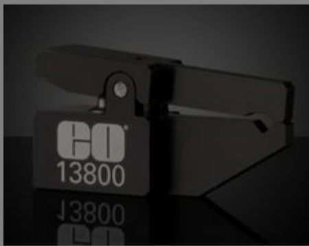
#13-800 - Small Lens Clamp for 4-8mm Dia. Optics €172,00