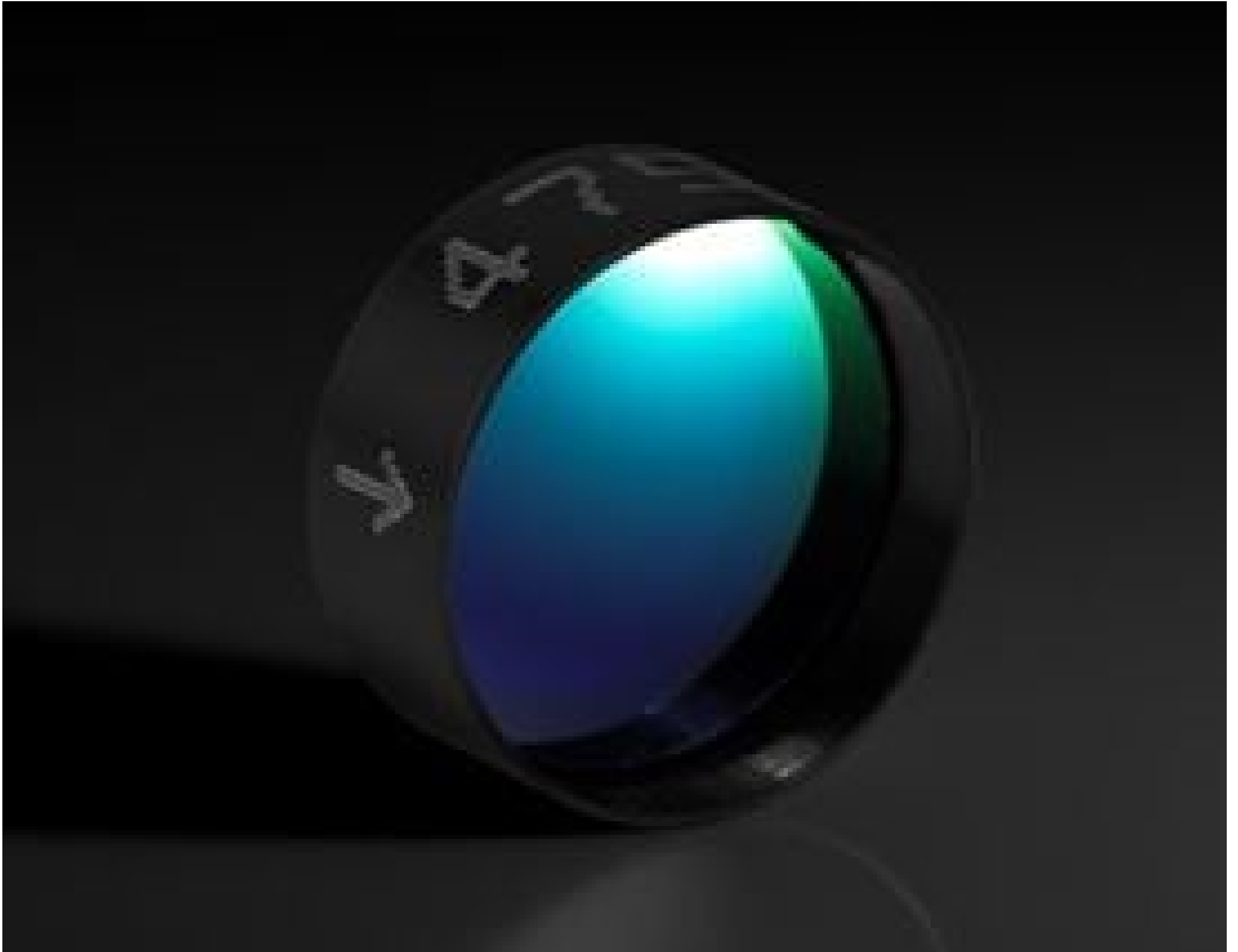
12.5mm Dia. OD8 High Blocking Bandpass Filter