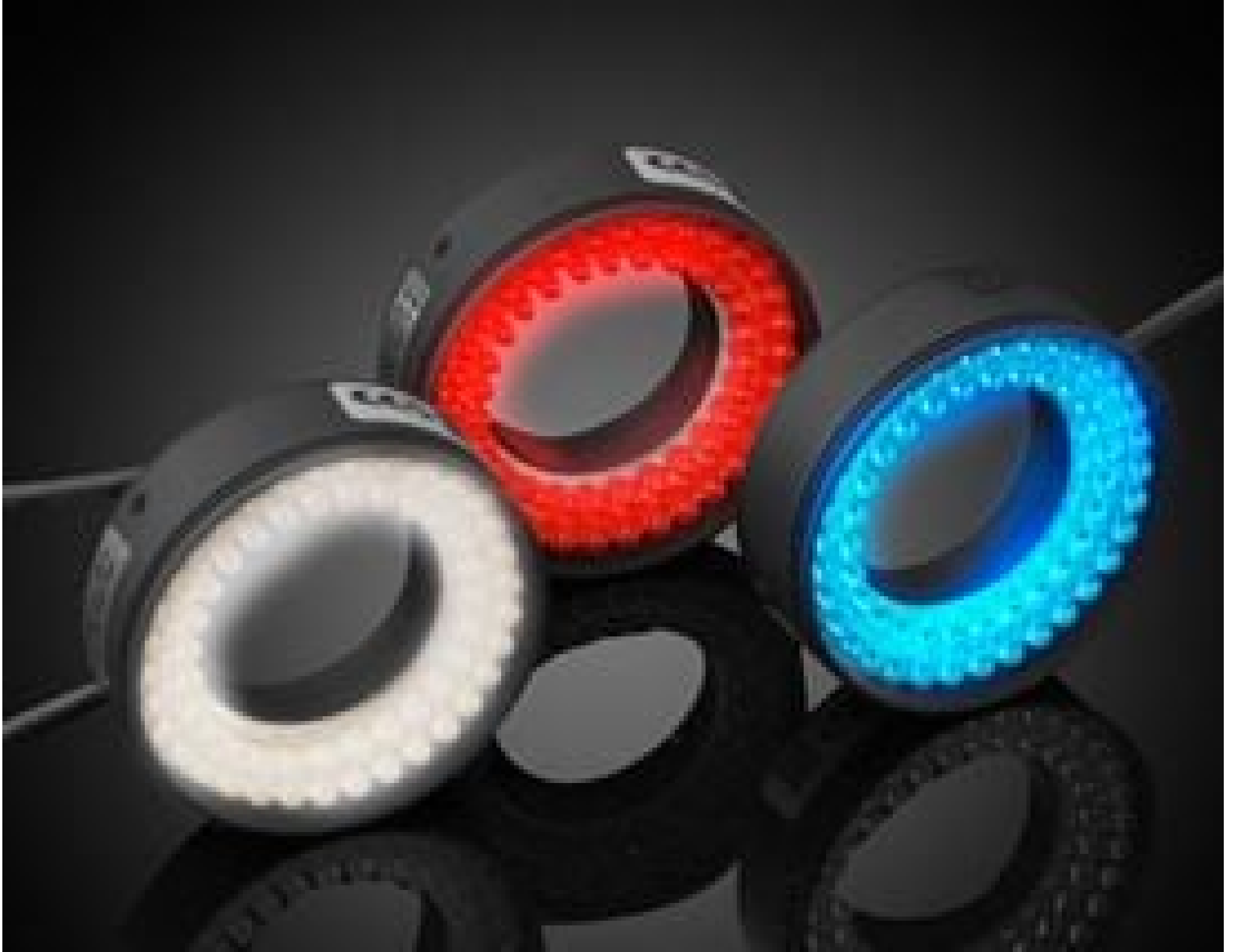
CCS High-Angle LED Ring Lights