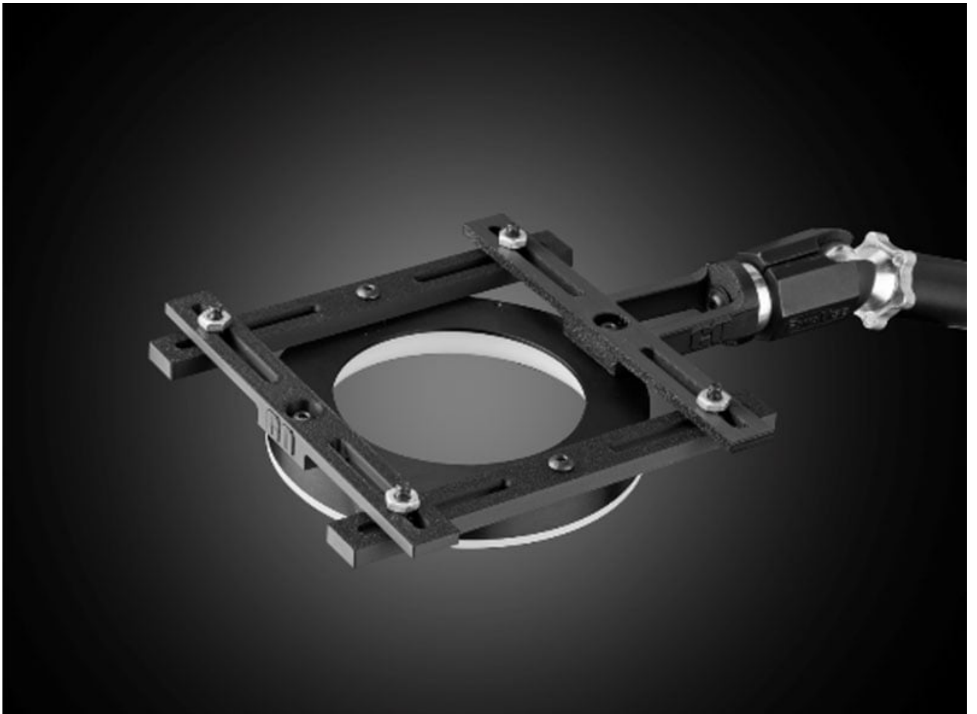
Ring Light Configuration