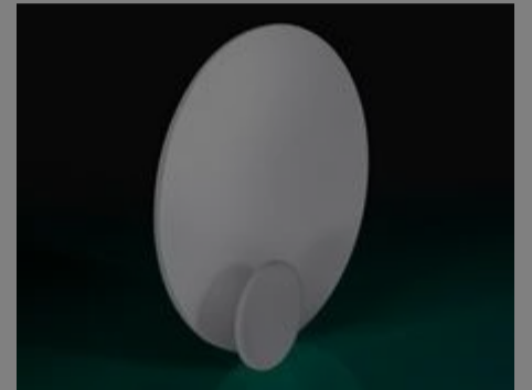
#34-474 - 25 x 25mm White Diffusing Glass €36,00