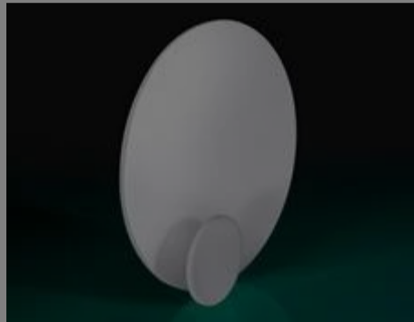
#34-471 - 12.5mm Dia. White Diffusing Glass €30,25