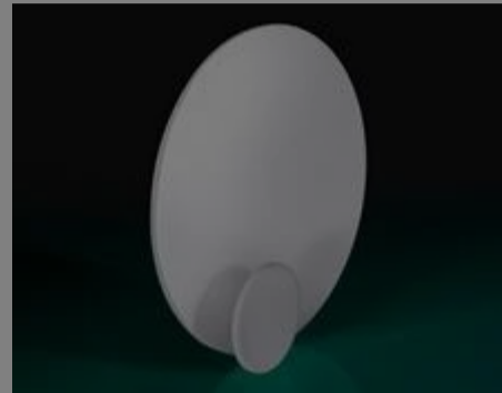
#34-473 - 25mm Dia. White Diffusing Glass €36,00