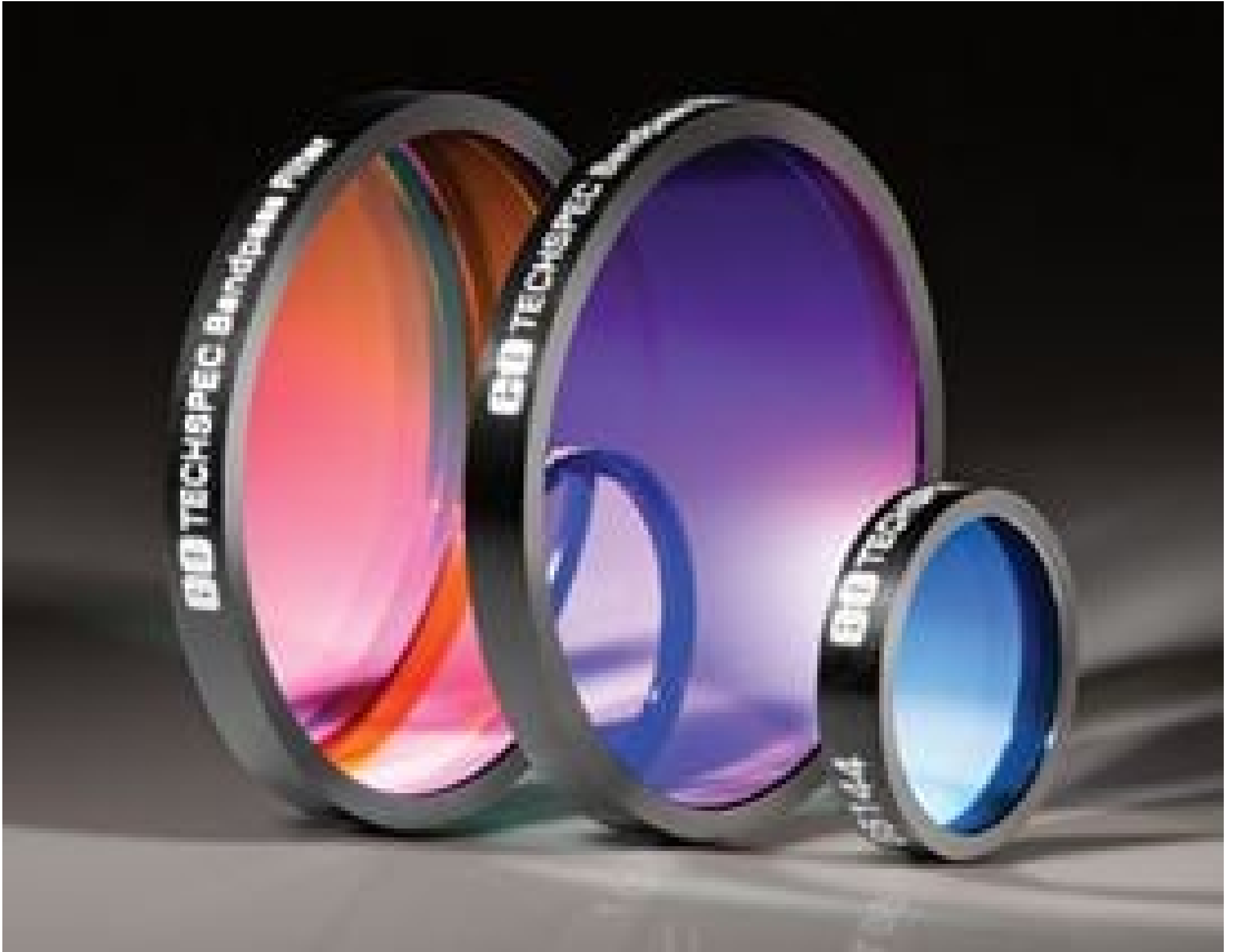
TECHSPEC Hard Coated OD 4.0 5nm Bandpass Filters