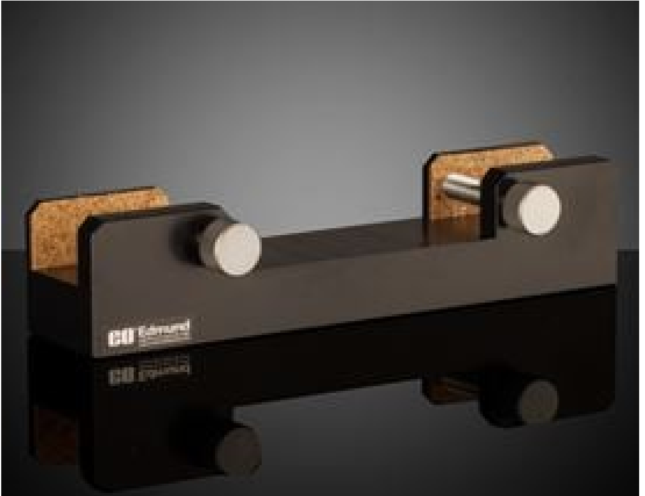
80mm Sq., Fixed Filter Holder